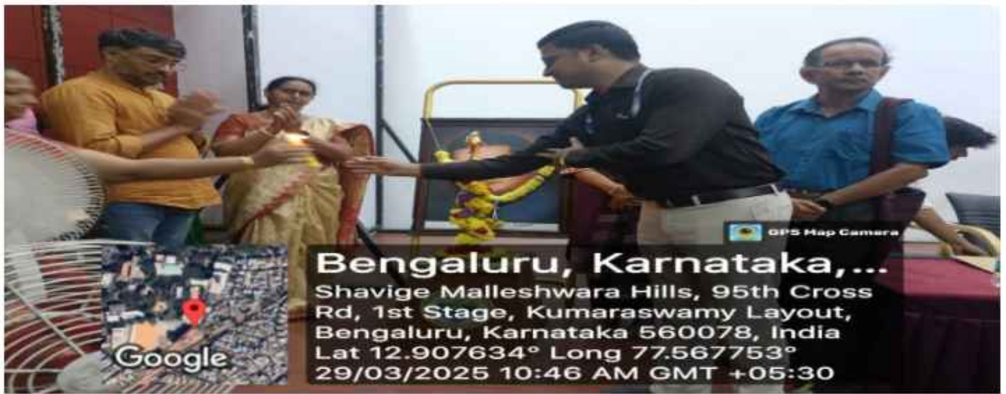
INAUGURATION BY PRINCIPAL