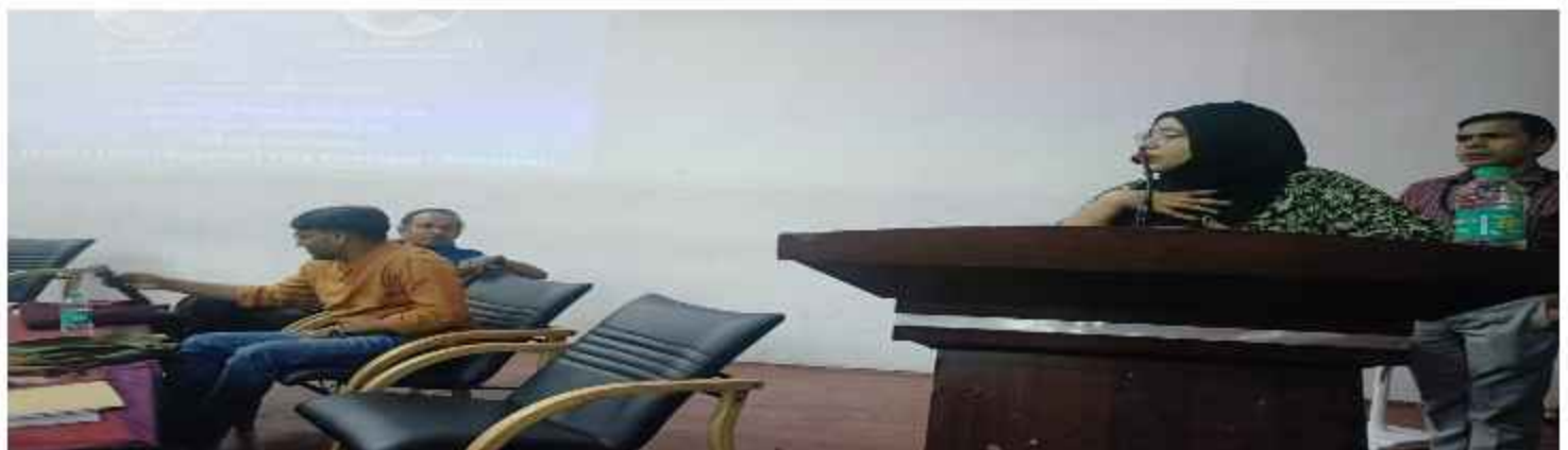
QUESTIONS ASKED BY THE STUDENTS RELATED TO THE IMPORTANCE OF THE LANGUAGE