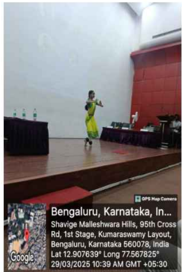
GROUP OF PHOTO OF THE EVENT RESOURCE PERSONS & INAUGURAL DANCE BY STUDENT