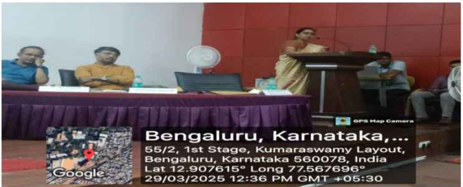
SPEECH BY THE RESOURCE PERSON