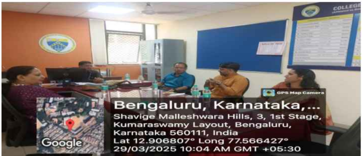
RESOURCE PERSONS DISCUSSION ON LITERATURE & LANGUAGE WITH PRINCIPAL