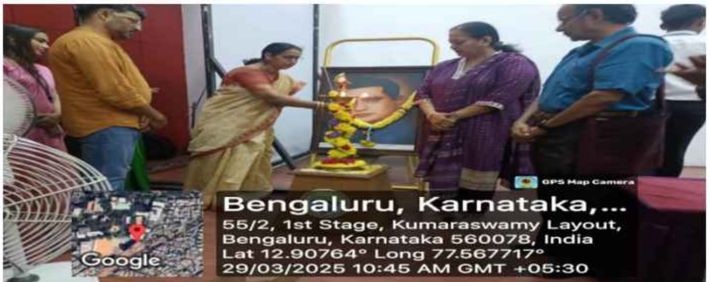
INAUGURATION BY RESOURCE PERSON