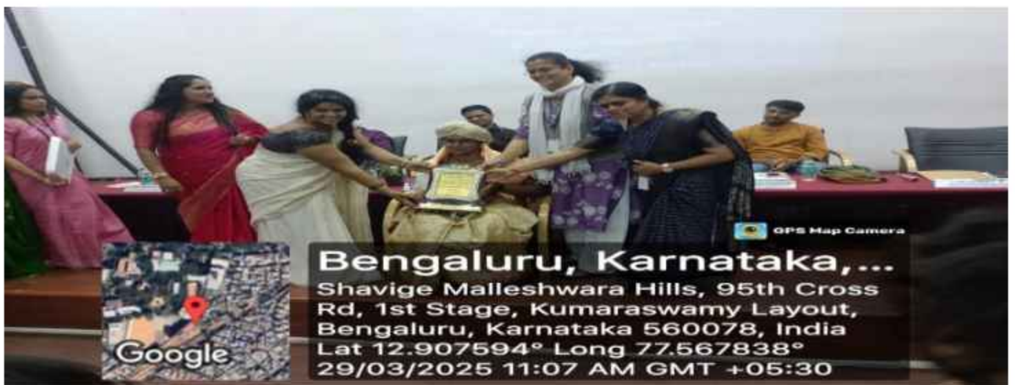
FELICITATION TO RESOURCE PERSON