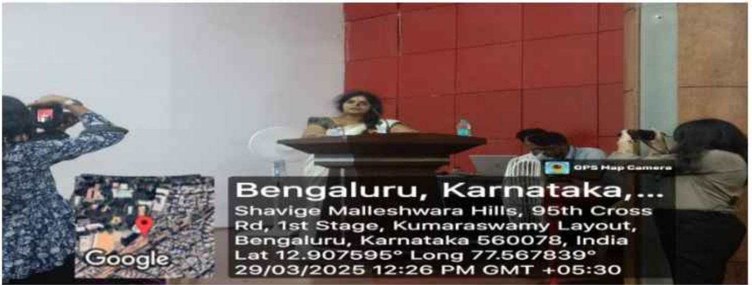
INTRODUCTION OF RESOURCE PERSON