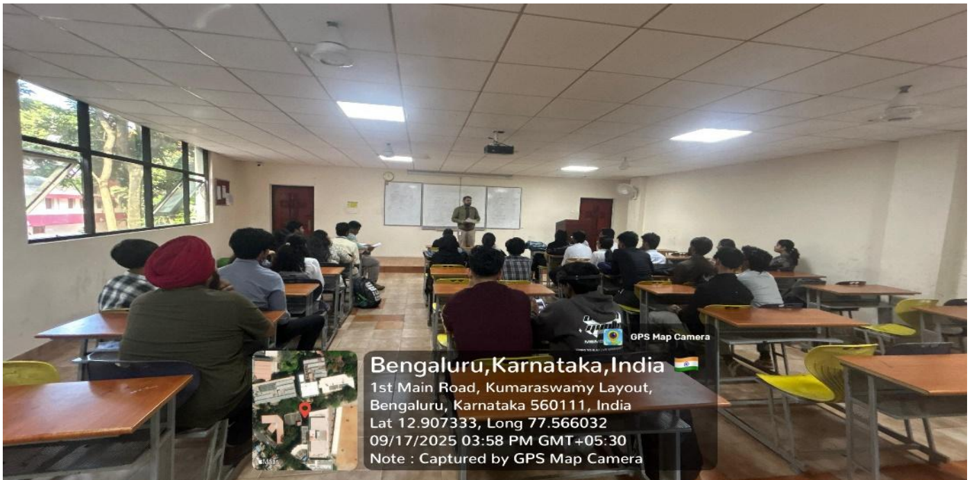
JUDGE IS GIVING HIS FINAL GUDJMENT AND PROVIDING THE INFORMATION TO STUDENTS IN MORE ON ACTIVITIES