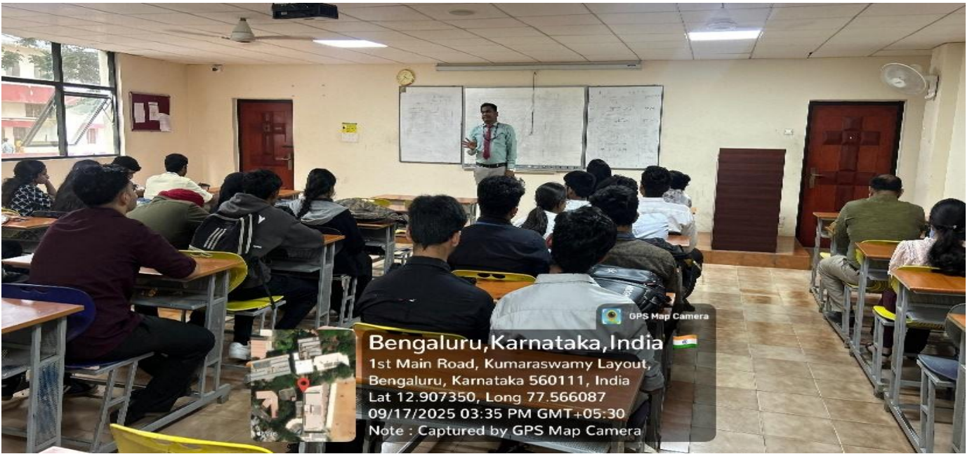
FACULTY INCHARGE IS GIVING THE INTRODUCTION OF EVENT AND THE JUDGE