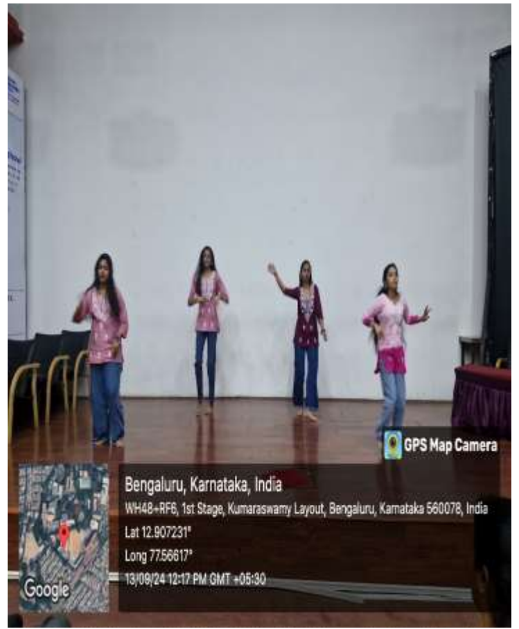
PANEL DISCUSSION , DEBATE & GROUP DANCE