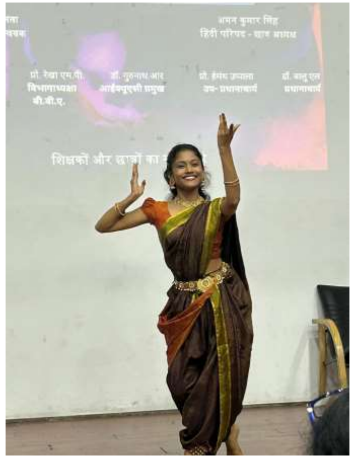
INAUGURATION OF THE HINDI DIWAS