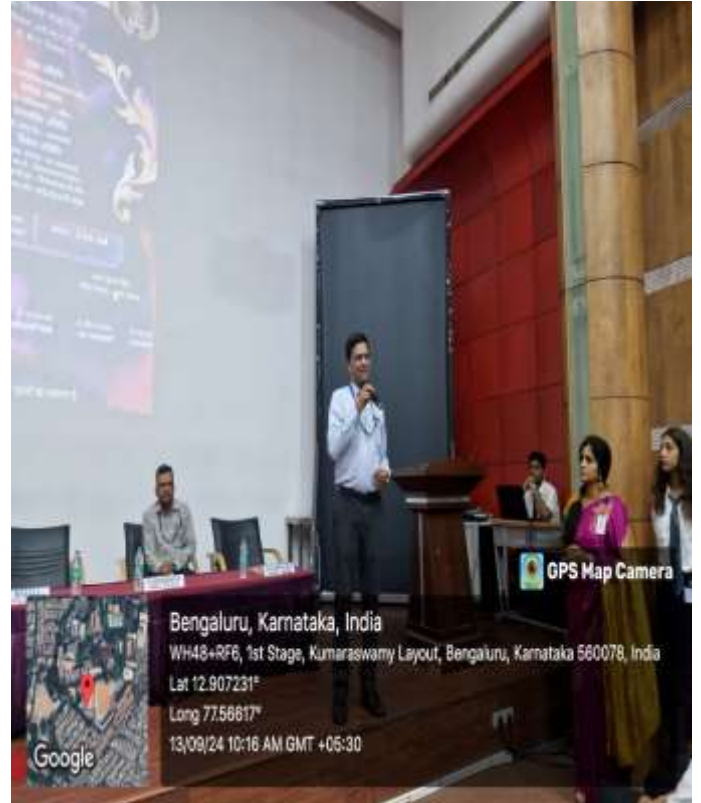
SPEECH BY CHIEF GUEST AND PRINCIPAL