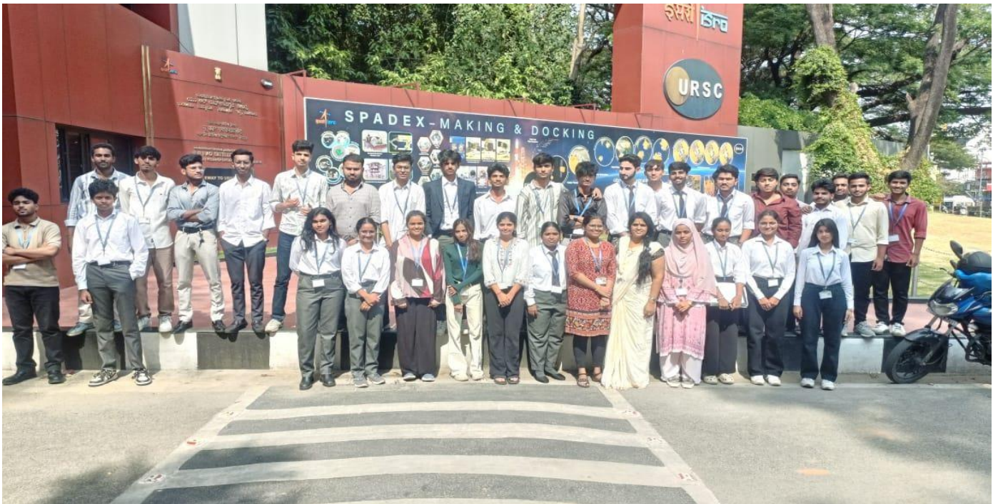
STUDENTS WHILE RETURNING BACK TO COLLEGE