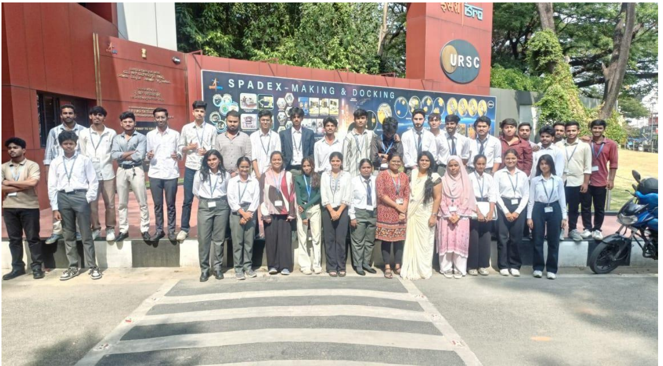
STUDENTS WERE VERY HAPPY TO WATCH THE SATELLITE CENTER