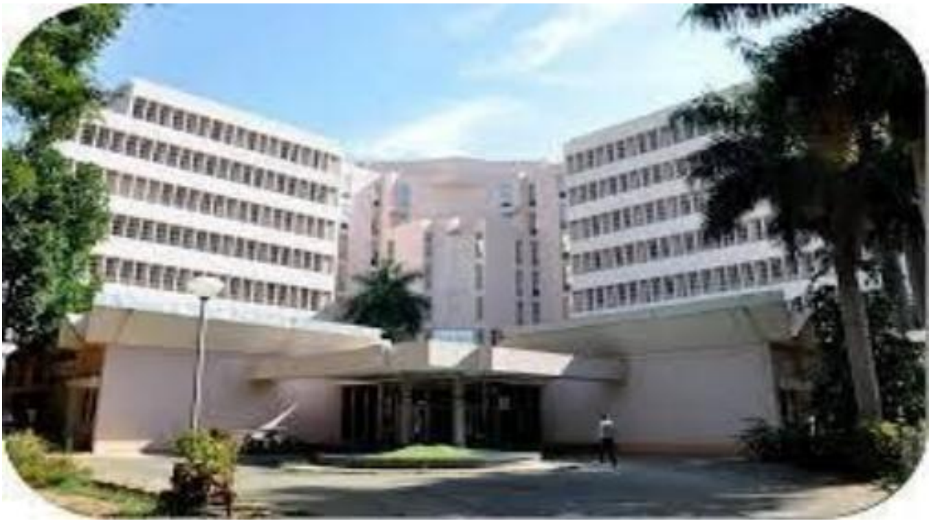
UR RAO SATELLITE RESEARCH CENTER