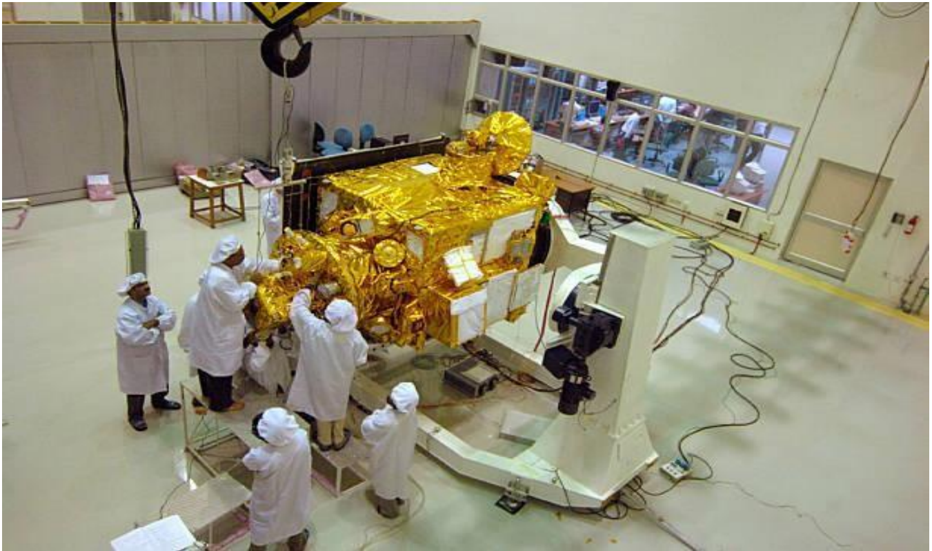
PHOTO OF CHANDRAYAN RESEARCH WORK