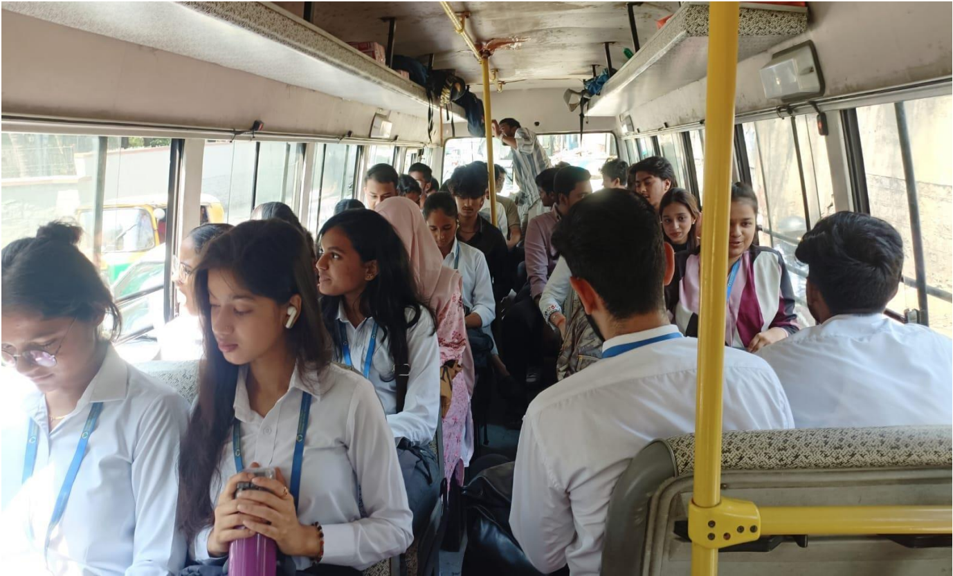
STUDENTS ON THE WAY TO ISRO SATELLITE CENTER