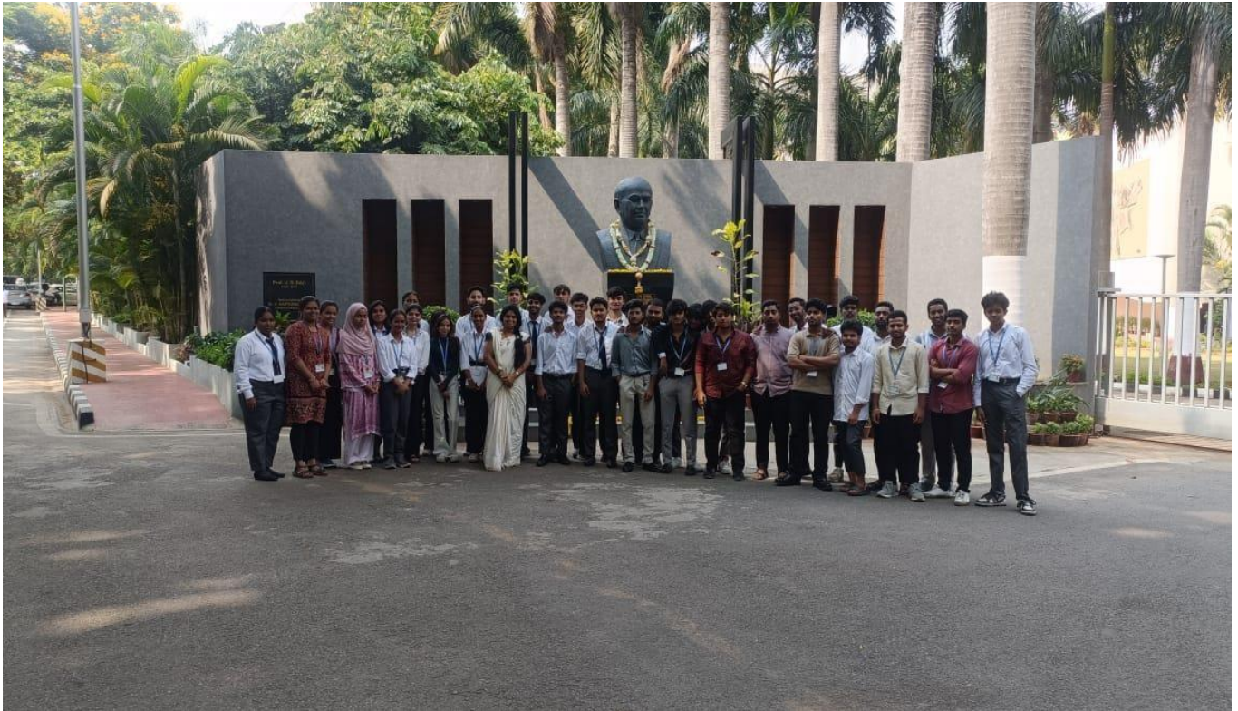
STUDENTS NEAR THE ENTRANCE OF SATELLITE RESEARCH CENTER