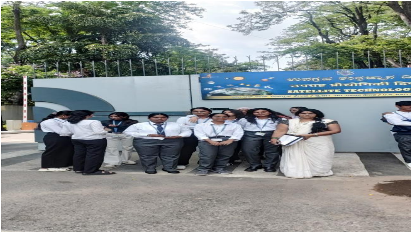
STUDENTS NEAR THE ENTRANCE GATE OF THE ISRO