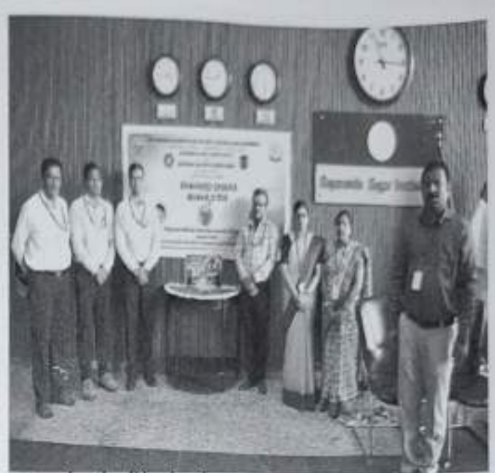
The floral tributes to the martyrs by the Dignitaries.

Bengaluru, Karnataka, India 🇮🇳 Shree Maitoshwara Hills, 1st Stage, Kumarawamy Layout, Bengaluru, Karnataka 560011, India Lat 12.907104° Long 77.566218° Monday, 23/03/2026 11:14 AM GMT +05:30