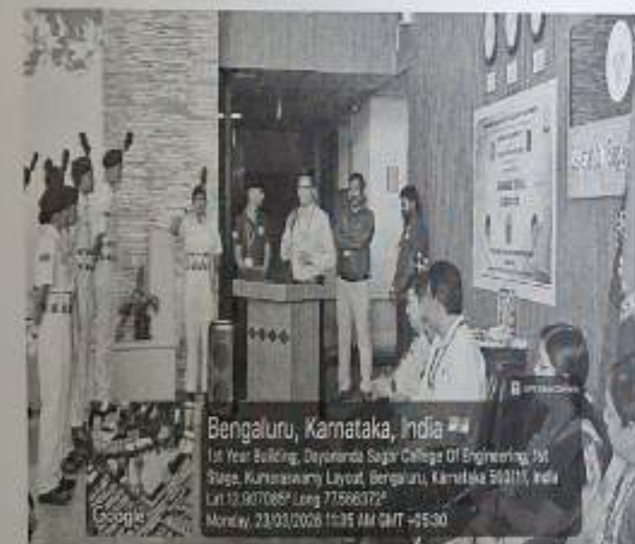
A Speech by NCC Cadets About the Shaheed Bhagat Singh, Sukhdev and Rajguru.

Bengaluru, Karnataka, India 🇮🇳 1st Year Building, Dayananda Sagar College Of Engineering, 1st Stage, Kumarawamy Layout, Bengaluru, Karnataka 560011, India Lat 12.907085° Long 77.566172° Monday, 23/03/2026 11:35 AM GMT +05:30