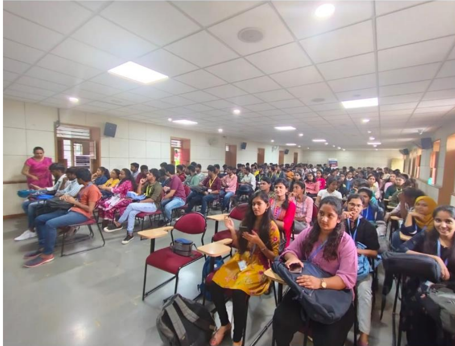
Pic 3: Students listening to the speaker