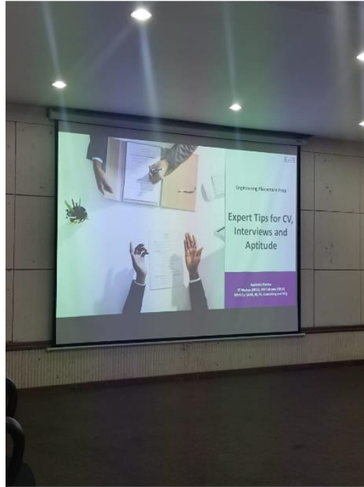
Pic 1 : Seminar on Placement Preparedness – CV ,Interviews,Aptitude.