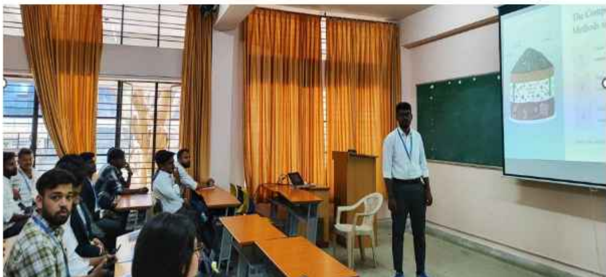
2. Clearing the doubts about the methods of Composting