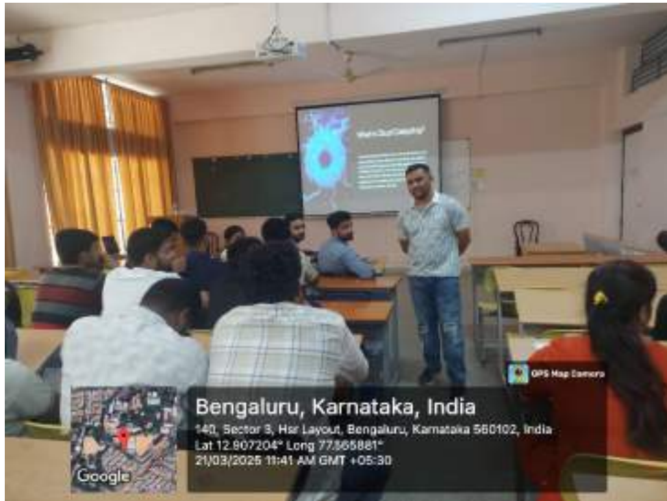
Pic(1)-Introduction to the concept