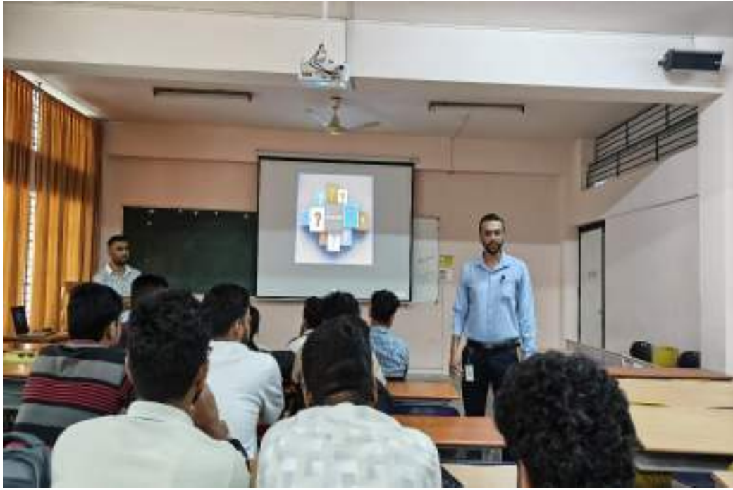
Pic(2). Question and Answer Session