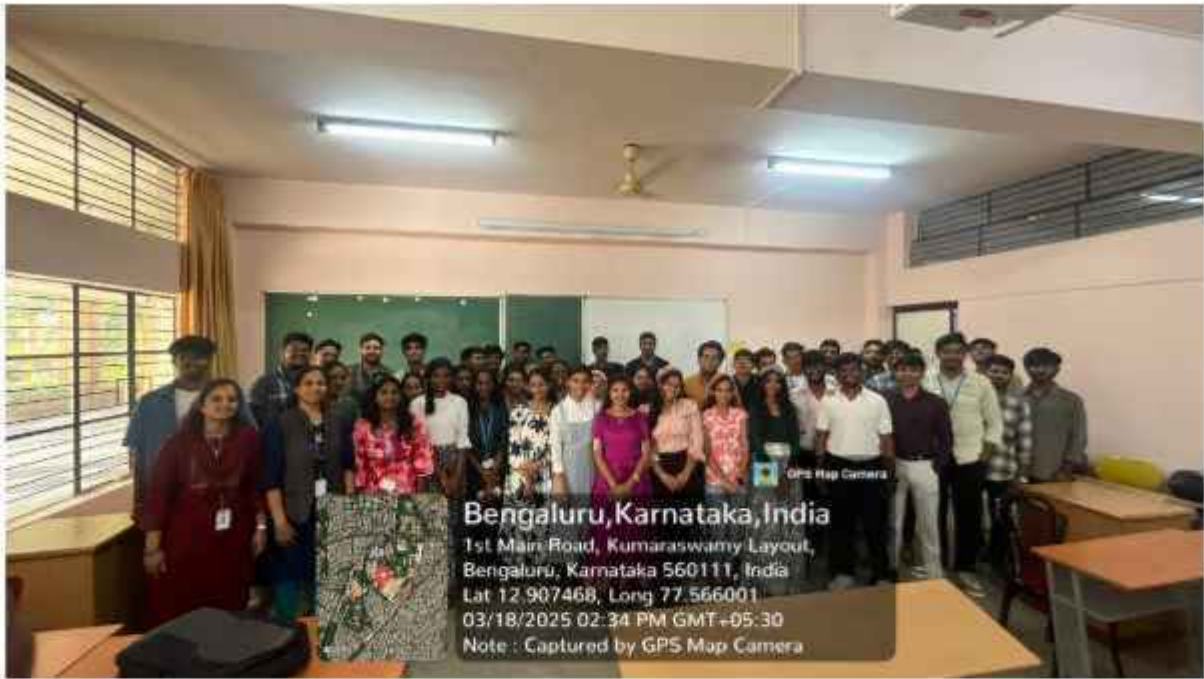
Photo 3- Retro Style