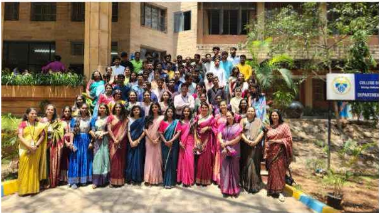
Photo 4- Ethnic Day