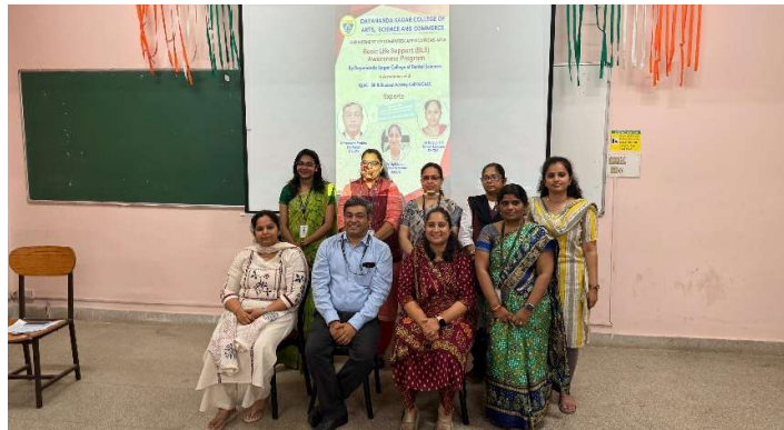
Pic 6: Group Photos