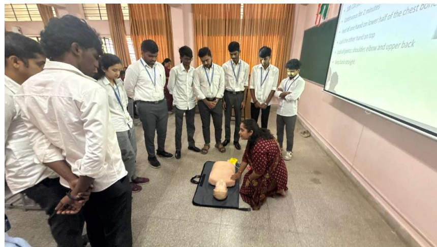
Pic 3: Hands on demo on CPR