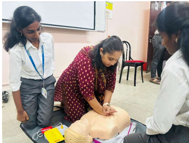
Pic 5: CPR techniques