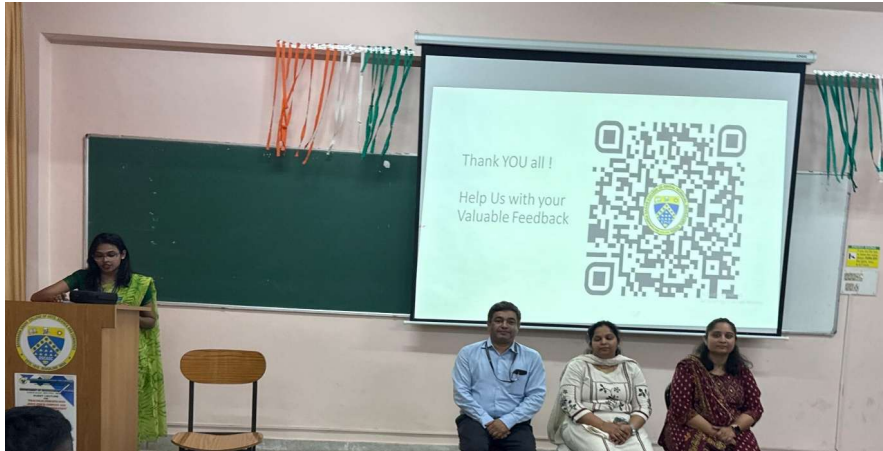
Pic 1 : Introduction to BLS awareness program