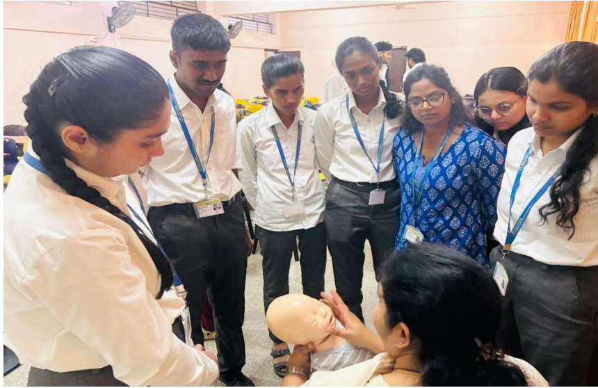
Pic 4: Hands on demo on foreign object extraction in infants