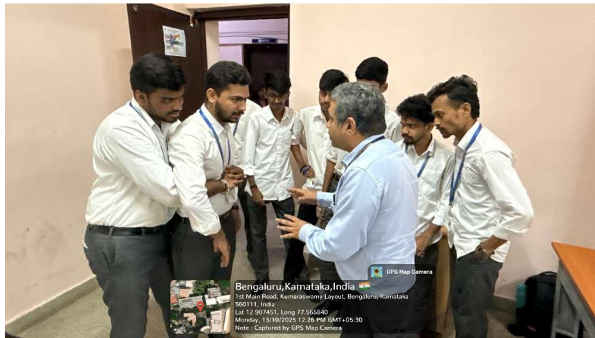
Pic 2: Hands on demo on choking