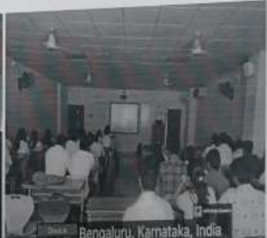
Bengaluru, Karnataka, India Wh4B+r16, 1st Stage, Kumaraswamy Layout, Bengaluru, Karnataka 560078, India Lat 12.907158° Long 77.598299° 24/03/2025 11:30 AM GMT +05:30