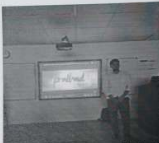
Bengaluru, Karnataka, India Wh4B+r16, 1st Stage, Kumaraswamy Layout, Bengaluru, Karnataka 560078, India Lat 12.907199° Long 77.598297° 24/03/2025 11:58 AM GMT +05:30