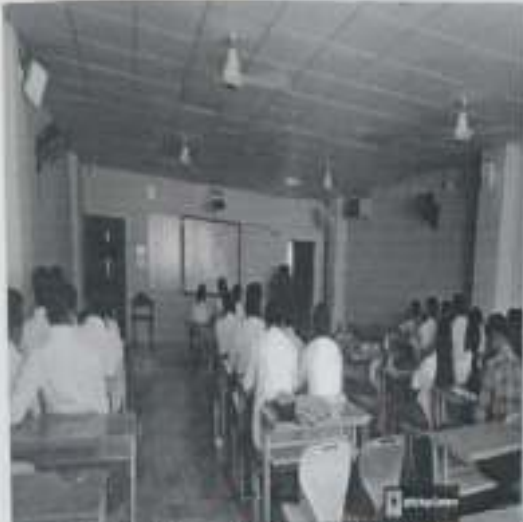
Bengaluru, Karnataka, India Wh4B+r16, 1st Stage, Kumaraswamy Layout, Bengaluru, Karnataka 560078, India Lat 12.907157° Long 77.598330° 24/03/2025 11:30 AM GMT +05:30