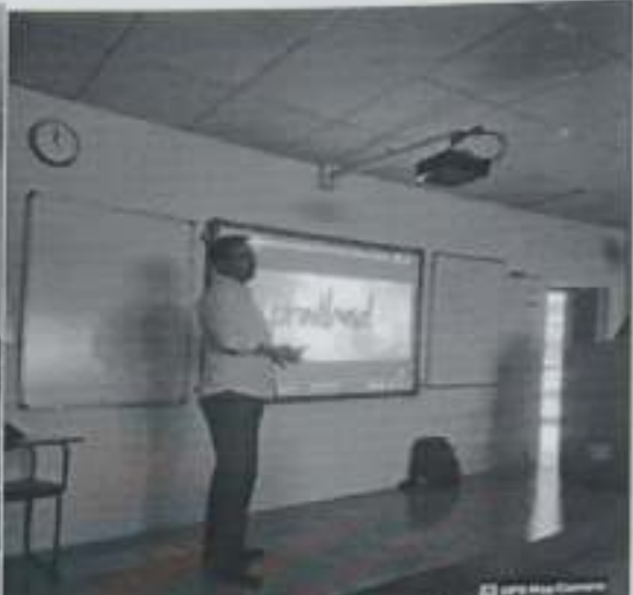
Bengaluru, Karnataka, India Wh4B+r16, 1st Stage, Kumaraswamy Layout, Bengaluru, Karnataka 560078, India Lat 12.907150° Long 77.598297° 24/03/2025 11:56 AM GMT +05:30