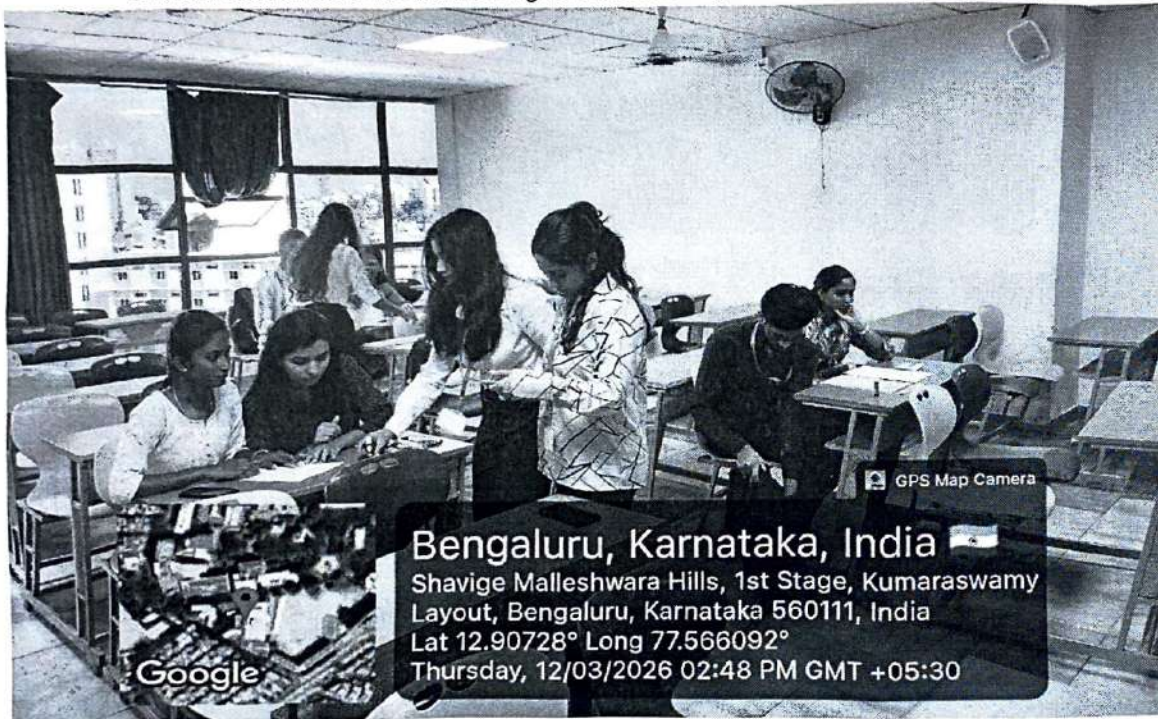
Photo.4 Participants Working on the data sets