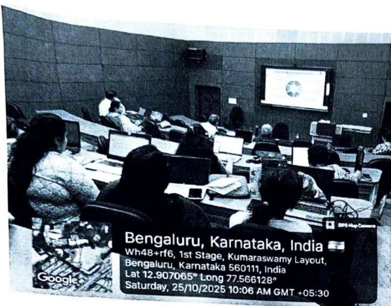
Bengaluru, Karnataka, India Wh48+rf6, 1st Stage, Kumaraswamy Layout, Bengaluru, Karnataka 560111, India Lat 12.907065° Long 77.566128° Saturday, 25/10/2025 10:06 AM GMT +05:30