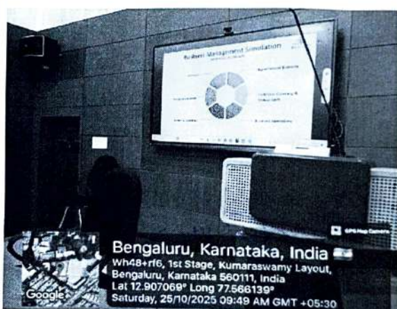
Bengaluru, Karnataka, India Wh48+rf6, 1st Stage, Kumaraswamy Layout, Bengaluru, Karnataka 560111, India Lat 12.907069° Long 77.566139° Saturday, 25/10/2025 09:49 AM GMT +05:30