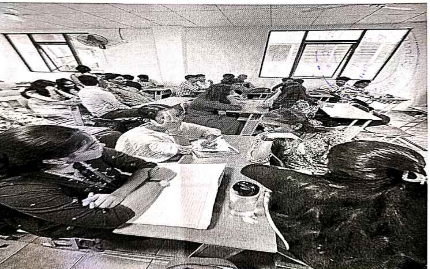
Group Photos with the Winners

Bengaluru, Karnataka, India Wh48+rmp, 1st Stage, Kumaraswamy Layout, Bengaluru, Karnataka 560111, India Lat 12.907196° Long 77.566673° Tuesday, 24/02/2026 02:40 PM GMT +05:30