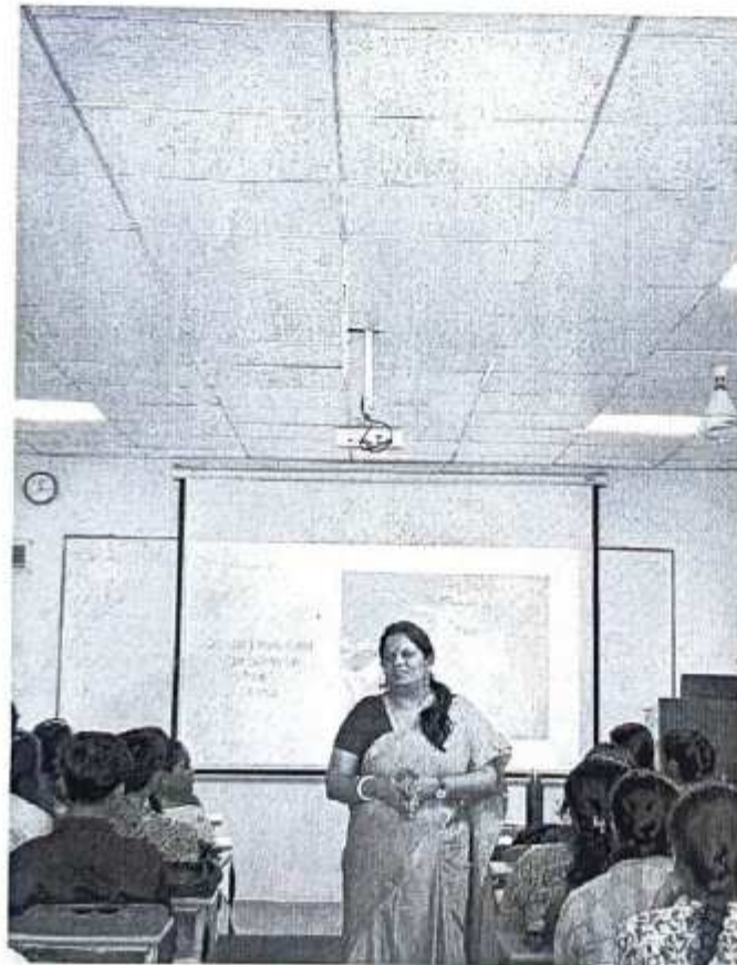
Speaker addresses the students