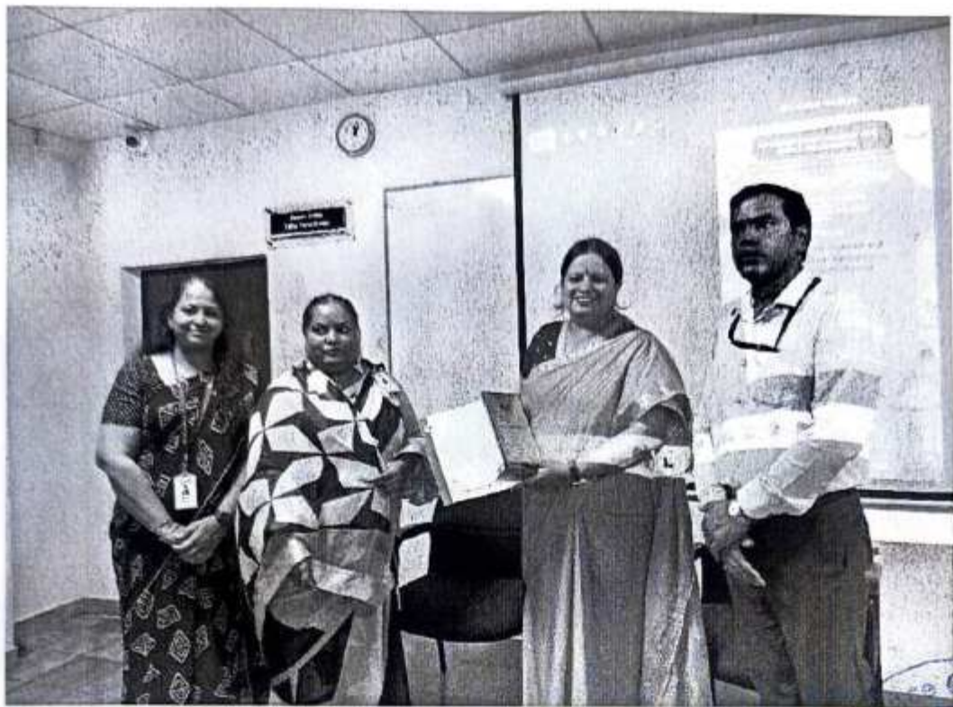
Felicitation to the guest speaker