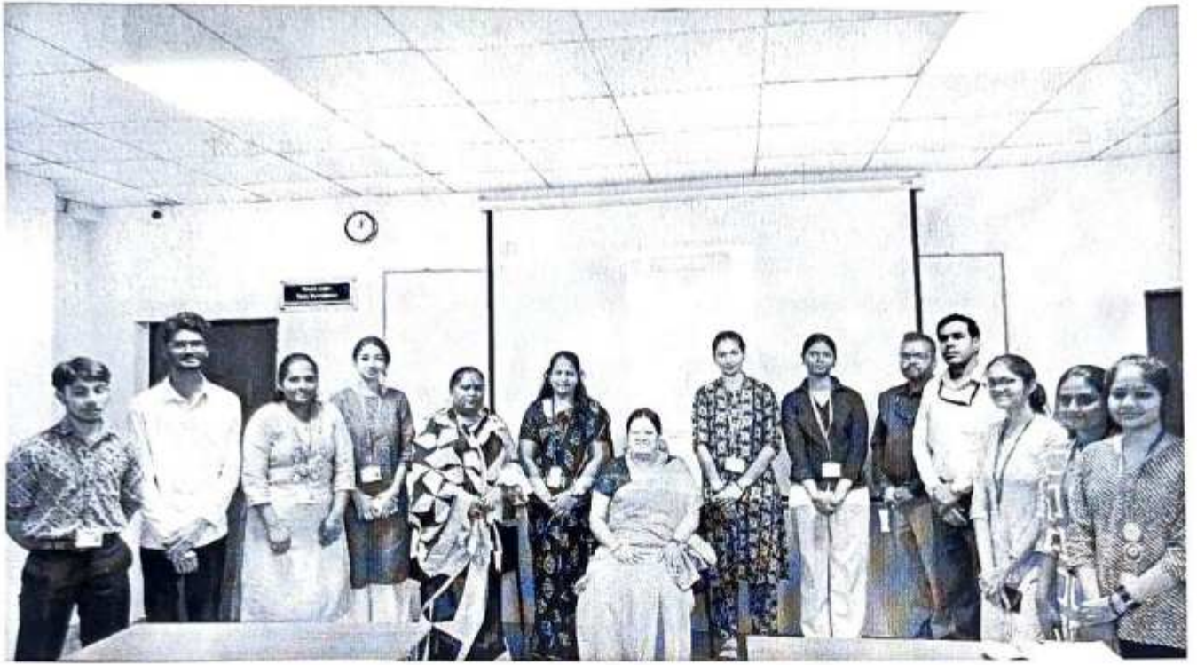
A Glimpse with the speaker and participants