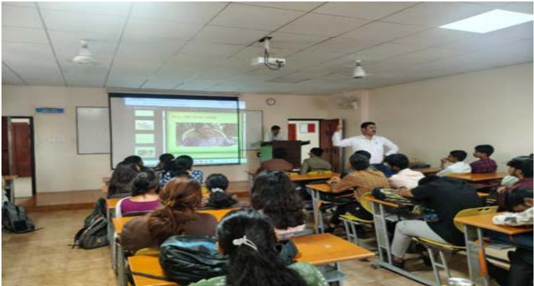
Photo-3 Speaker's speech