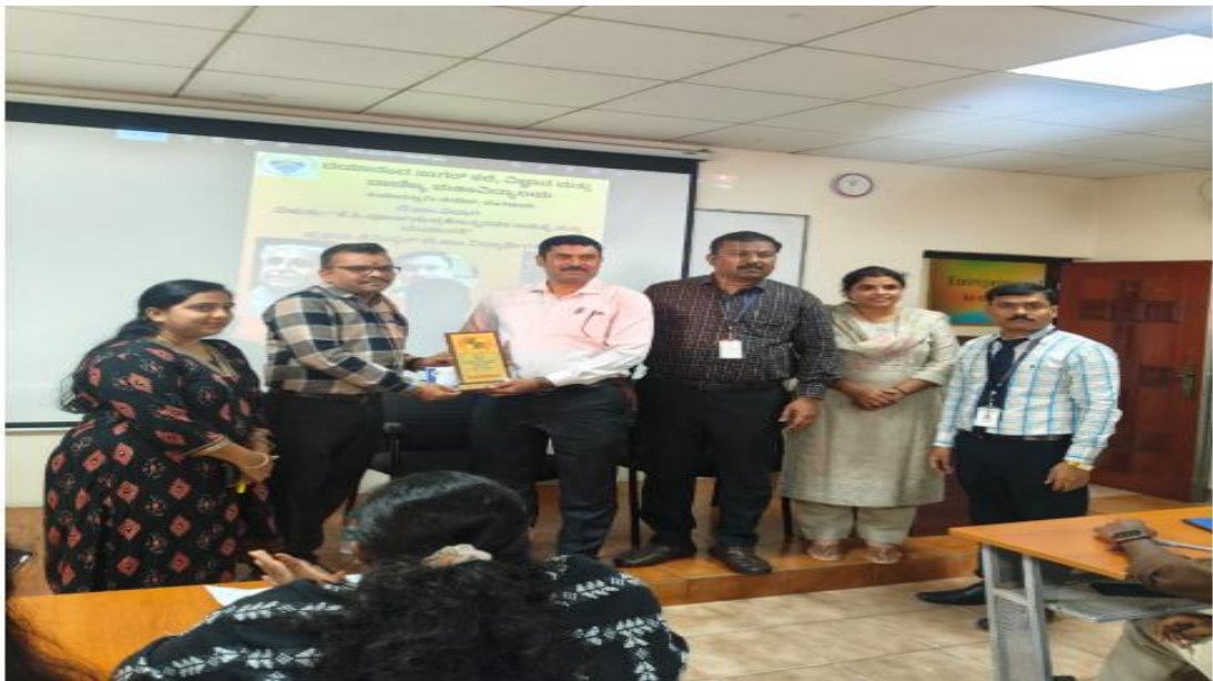
Photo-4 B.com HOD sir Honouring the Speaker