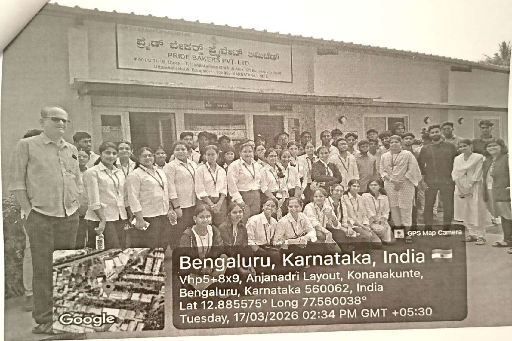
Photo #3: Faculty Coordinators with students at Pride Bakers Pvt. Ltd.