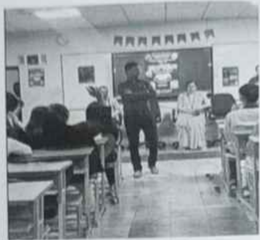
Commencing the event with an insightful opening session