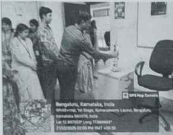
Bengaluru, Karnataka, India 90484mp, 1st Stage, Kumaraswamy Layout, Bengaluru, Karnataka 560075, India Lat 12.957527 Long 77.609962 21/02/2025 02:05 PM GMT +05:30