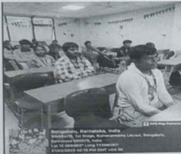
Bengaluru, Karnataka, India 90484mp, 1st Stage, Kumaraswamy Layout, Bengaluru, Karnataka 560075, India Lat 12.957527 Long 77.609962 21/02/2025 02:15 PM GMT +05:30