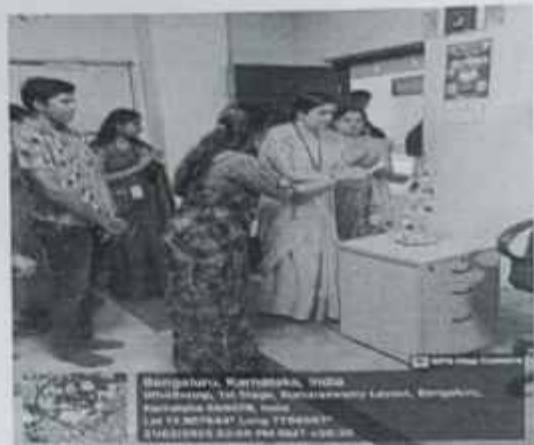
Bengaluru, Karnataka, India 90484mp, 1st Stage, Kumaraswamy Layout, Bengaluru, Karnataka 560075, India Lat 12.957527 Long 77.609962 21/02/2025 02:05 PM GMT +05:30