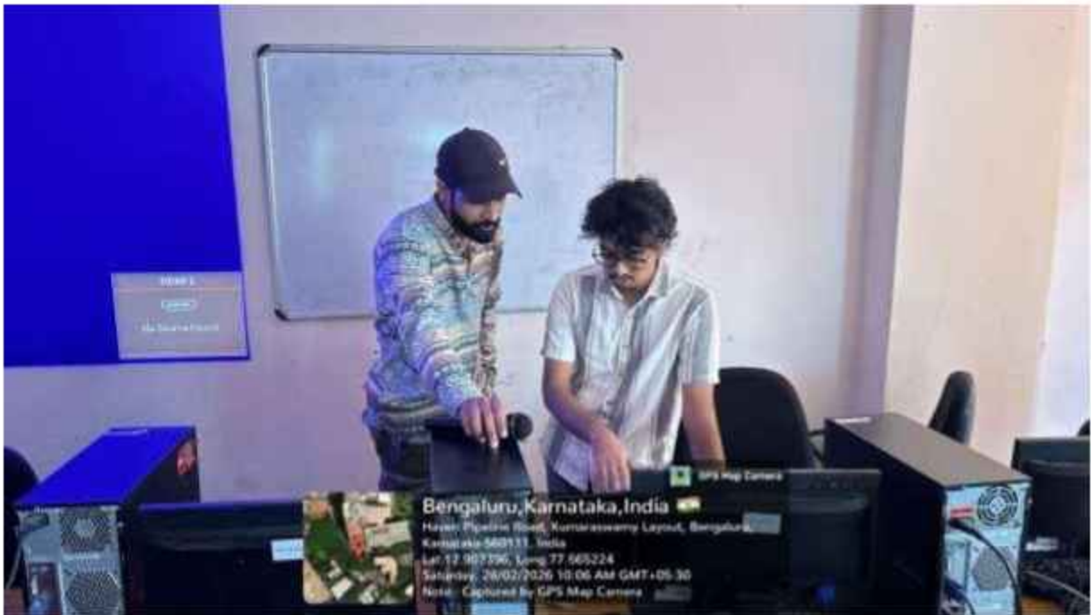
Pic 9 : Trainer Solving their doubts