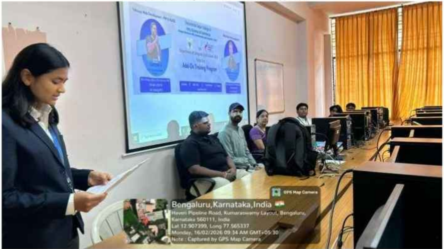
Pic 1: Introduction by HOD

PHOTOS - Day 1 - 16th Feb (Monday), 2026