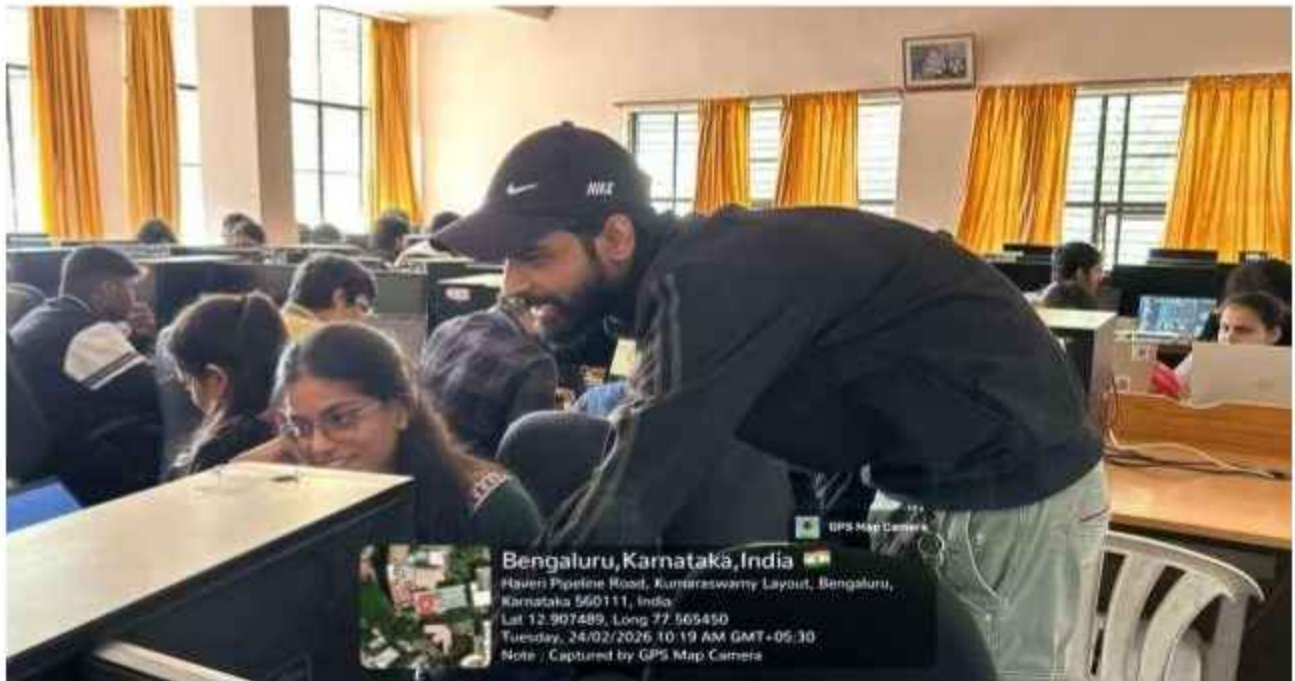
Pic 7: Trainer guiding students to build their project