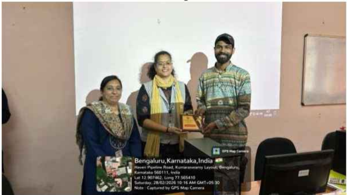
Pic 10: Token of appreciation to the trainer