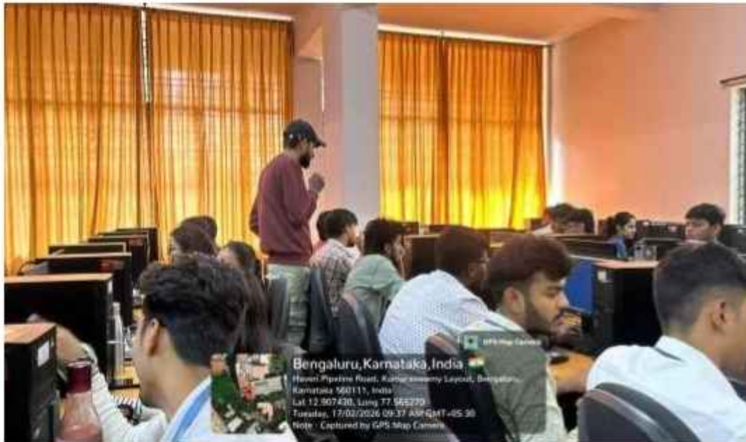
Pic 3: Trainer guiding