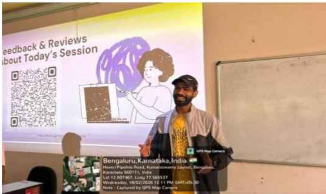
Pic 4: Trainer getting feedback