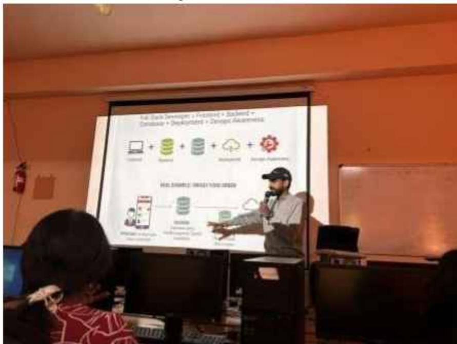
Pic 2: Trainer Introduction