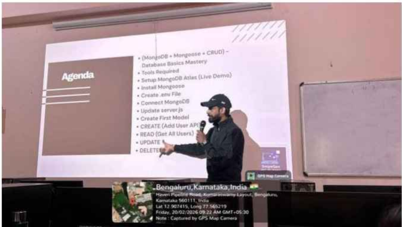
Pic 5: Introduction to agenda of the training PHOTOS - Day 5 - 23rd Feb (Monday), 2026