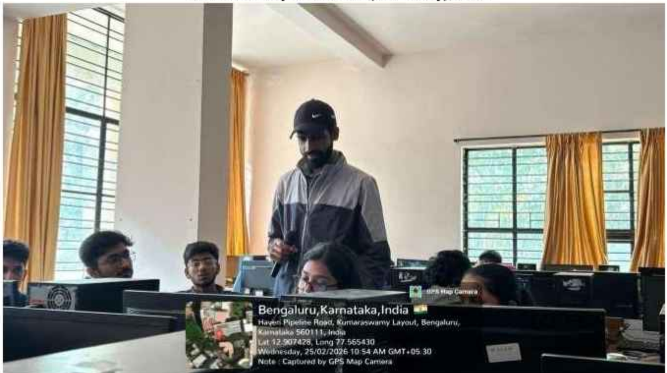
Pic 8: Student Demonstrating his project