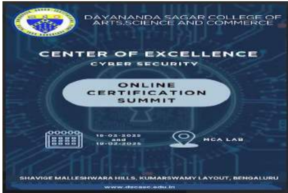
Fig 1: Boucher of Online Certification Summit