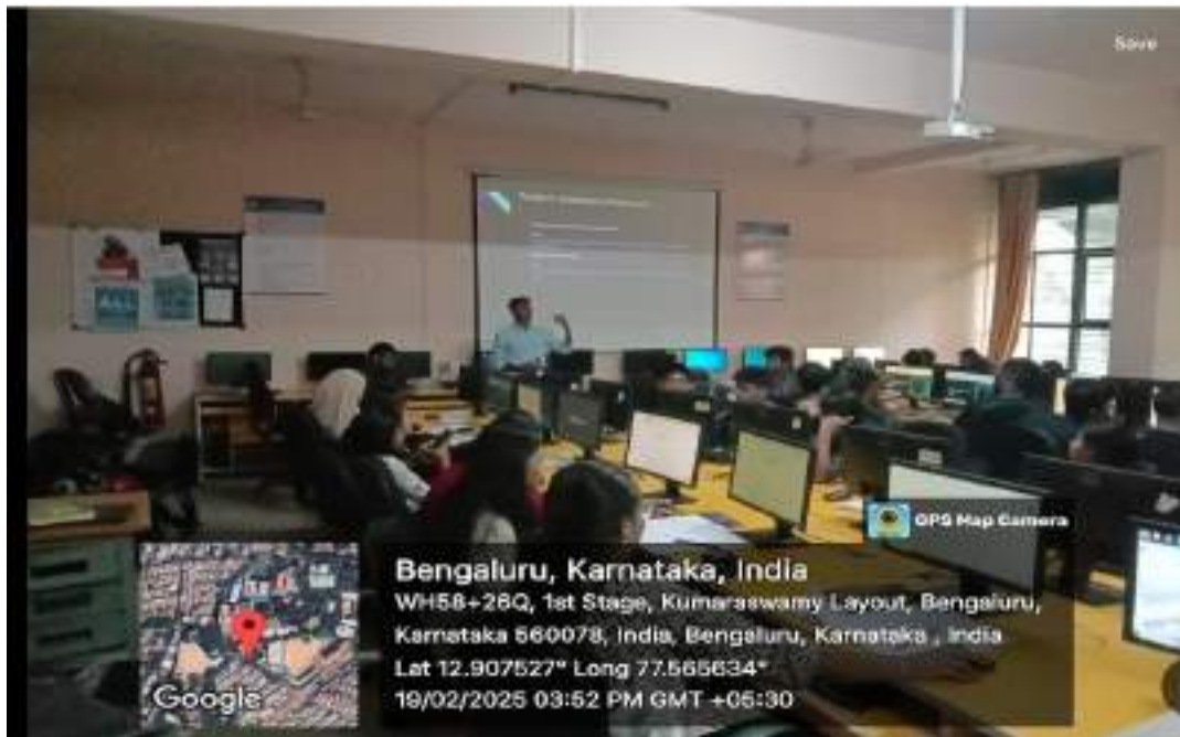
Fig 4: Students participating in the event