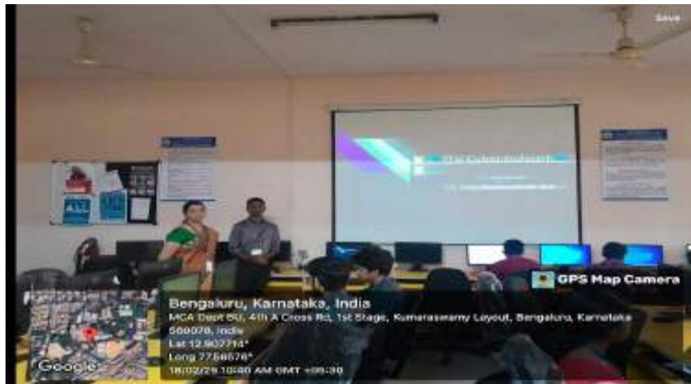
Fig 2: Hands-on on the online certification course