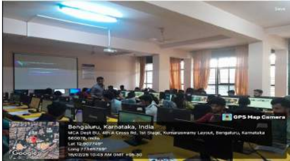
Fig 3 Students participating in the event