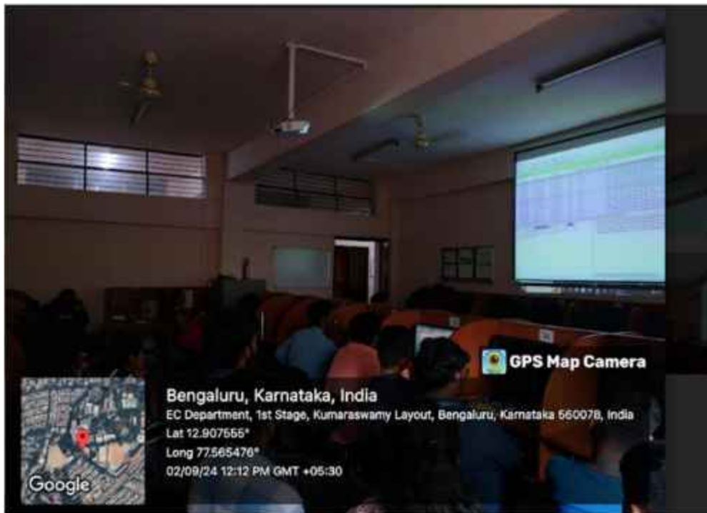
Pic(3)-Student's participation in an activity