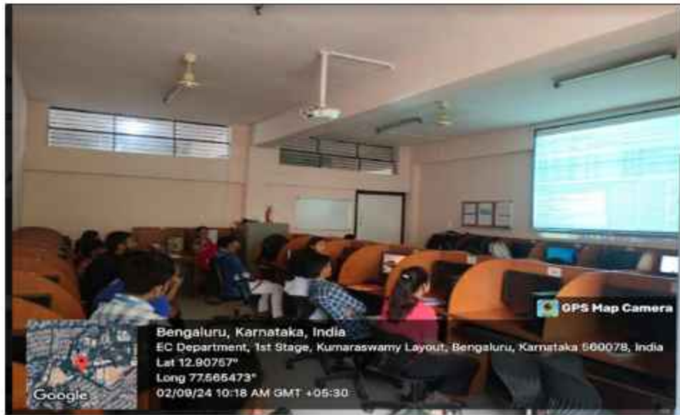
Pic(2)-Mrs.Akshatha Deepak explaining the Capturing of packets