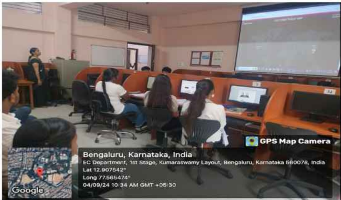
Pic(5)-Student's participation in an activity