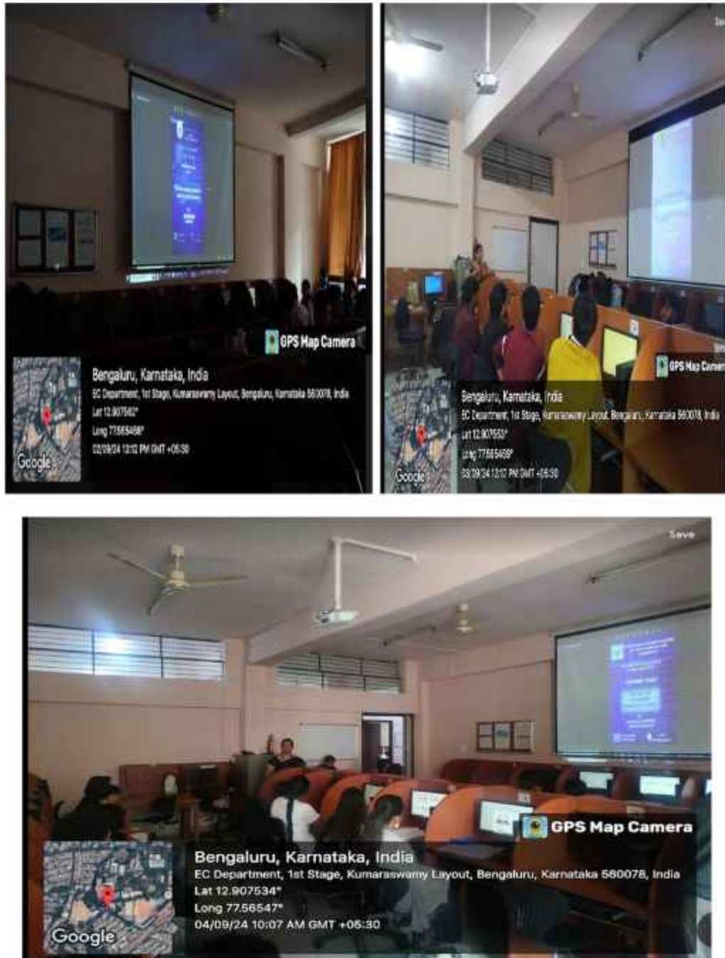
Pic(1): Wireshark's Powerful Analysis Capabilities session