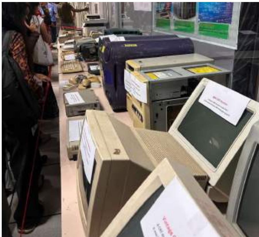
Pic 2: Evolution of Computers