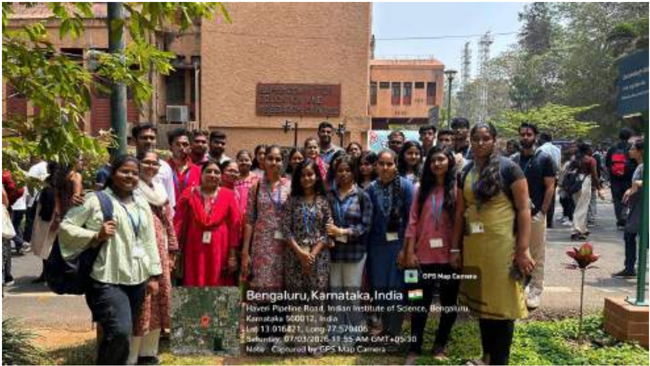
Pic 3: Visited Supercomputer Education and Research Centre (SERC) at IISc