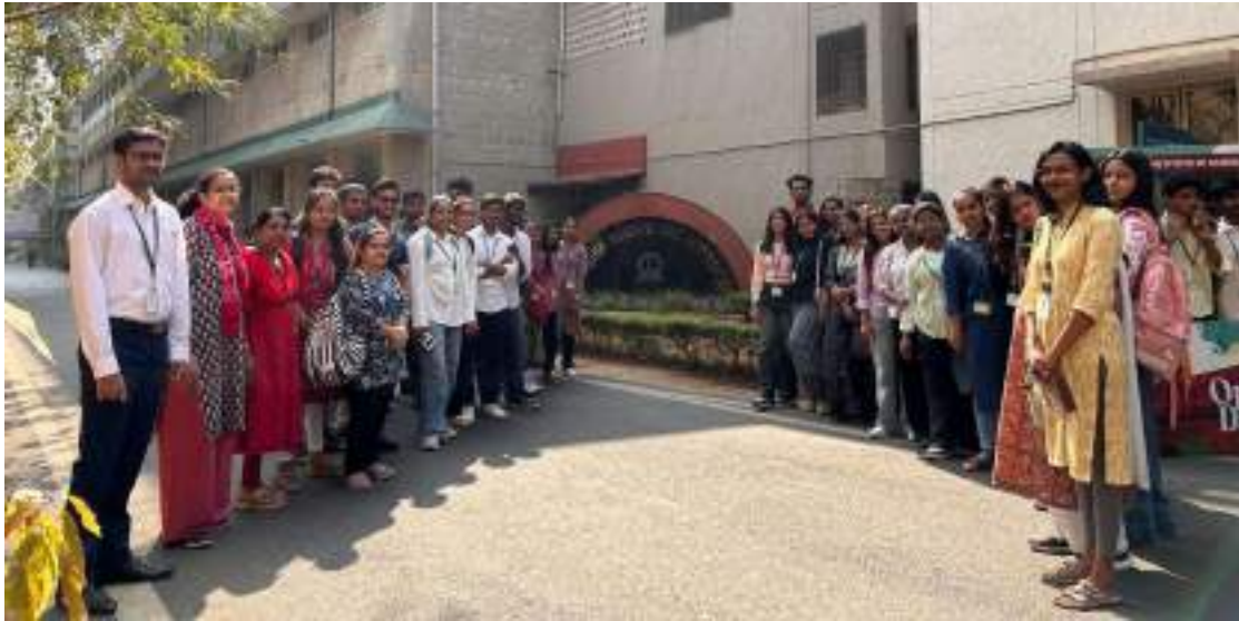
Pic 1: Visited Computer Science and Automation block at IISC