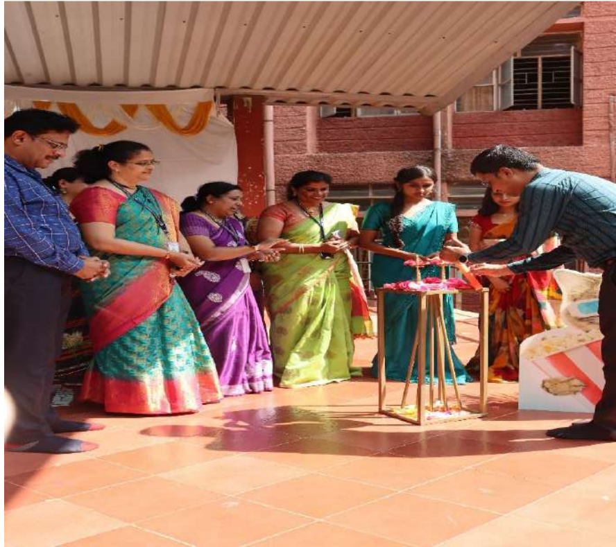
Photo1- Lighting lamp Ceramony