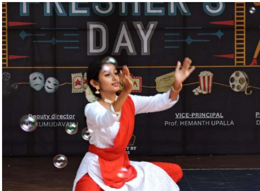
Photo2: Classical solo dance by 5 th Semester Student