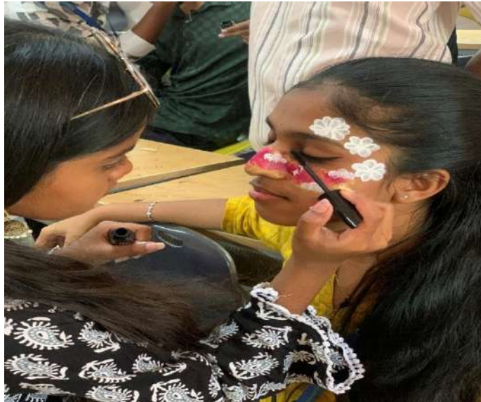
Photo4: Participants brought out their hidden talents through colorful expression