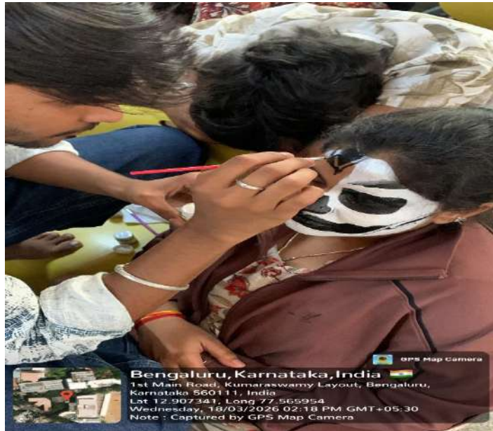
Photo1: Students actively engaged in presenting their creative ideas.