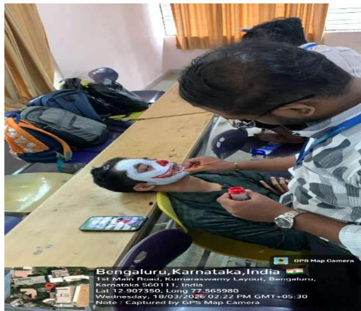
Photo2: Participants expressed their creativity through unique designs.