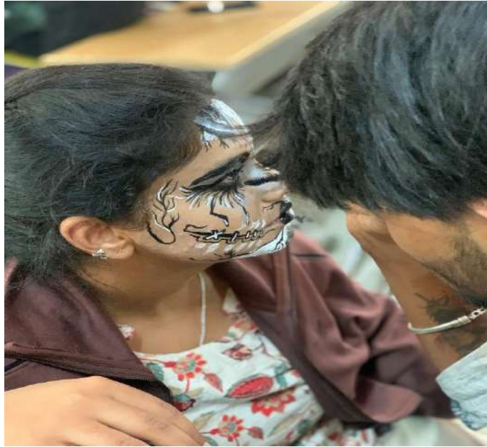
Photo3: Students presented innovative and eye-catching artwork