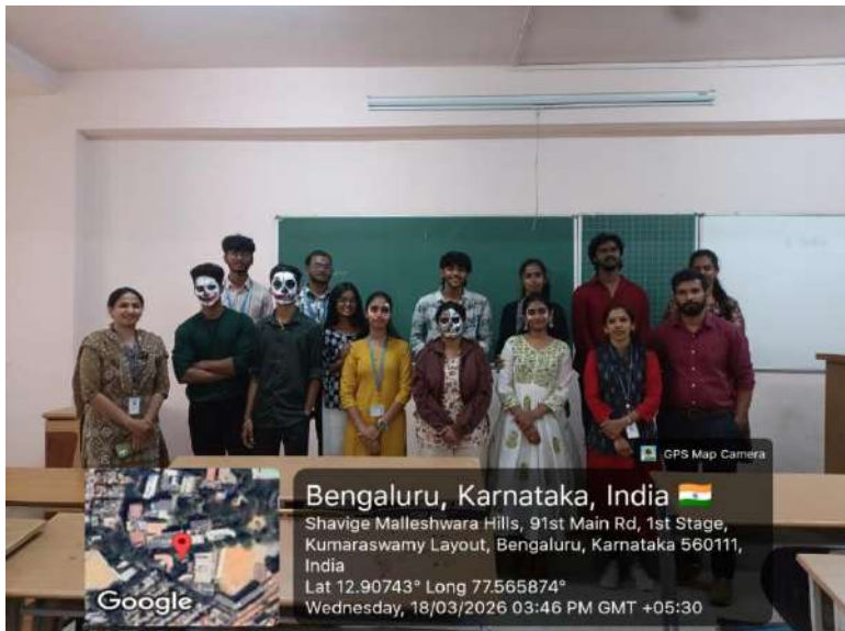
Photo 5: The event showcased the diverse talents of the participants.