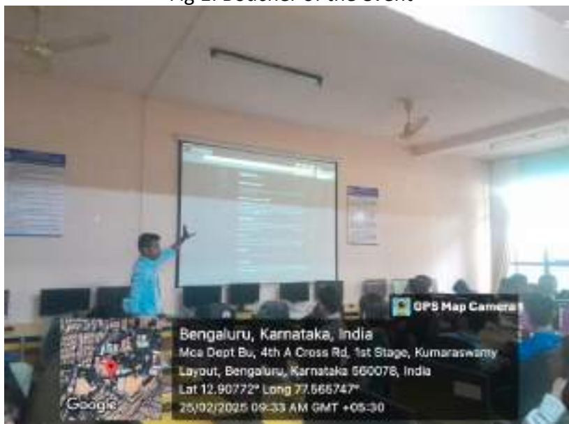
Fig 2: Mr Hitesh delivering the note