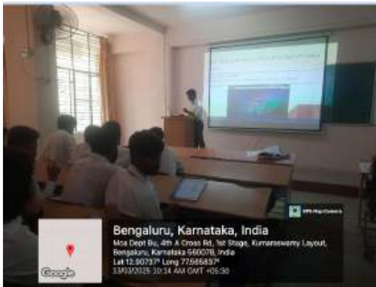
Fig 5: Students are actively participating