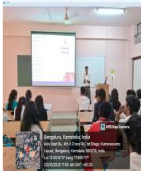
Fig 3&4: Students are actively participating