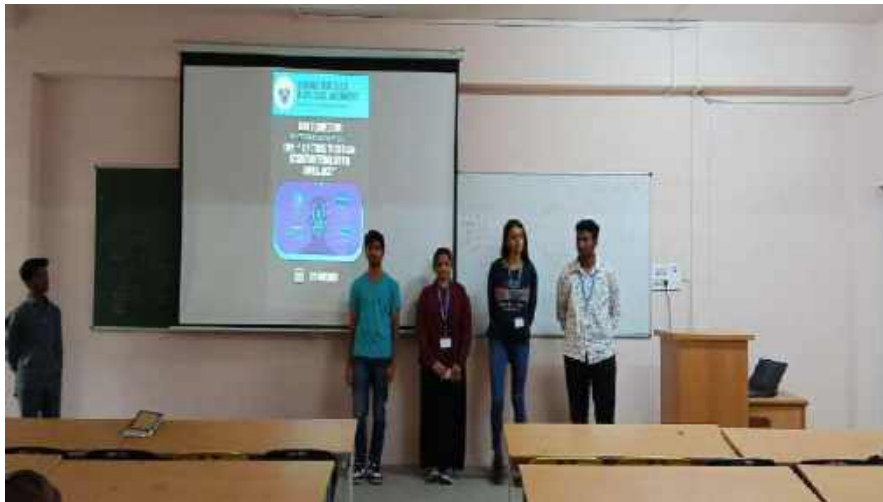
AGAINST Team Presenting their views on the topic