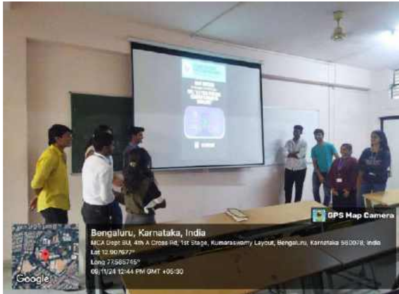
Debate Team- AGAINST and FOR Team Introducing each other.