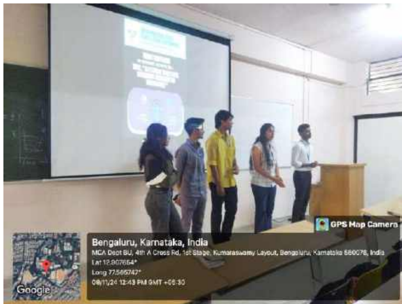
FOR Team presenting their views on the topic