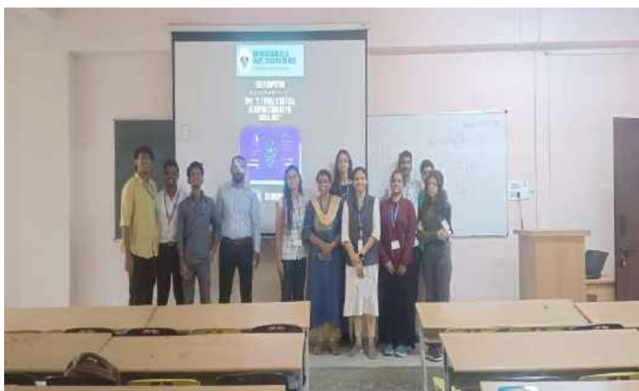
Group photo with faculty