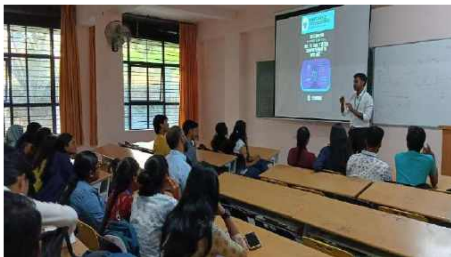
V Sem Student concluding the topic