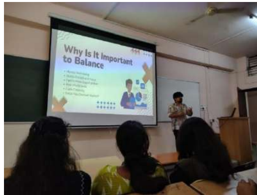
Pic(2) – Balancing hobbies with studies