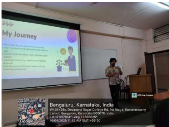
Pic(3) – ALUMNI sharing personal journey