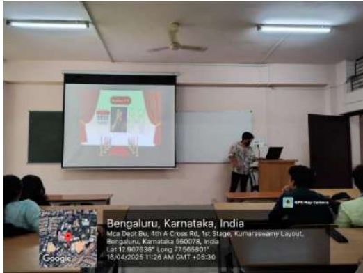
Pic(1) – Ice breaker questions