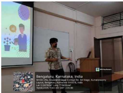
Pic(5) – Concluding remarks by ALUMNI