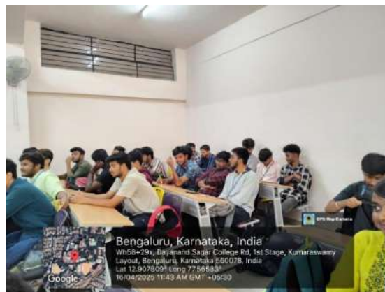
Pic(4) – Students connected with ALUMNI