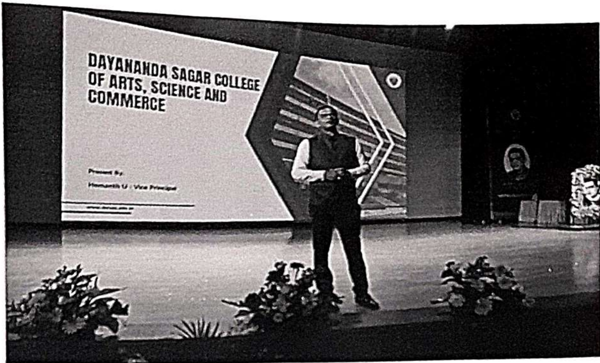
Photo2: Speech given by the Vice- Principal on Anti-ragging.