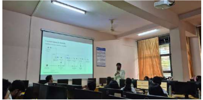
Pic(2) - Custom speech models