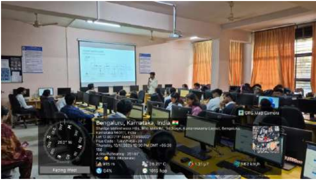
Pic(1) - Introduction to Azure Foundry services