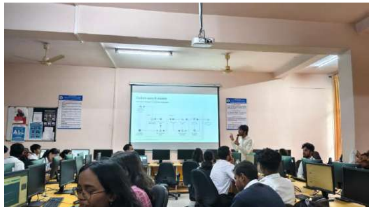
Pic(6) - Pattern matching