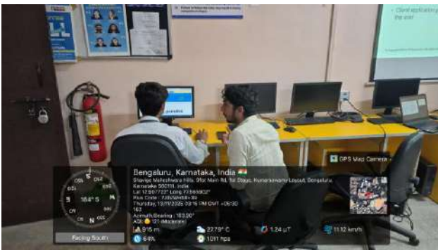
Pic(3) - Hands-on building LLM