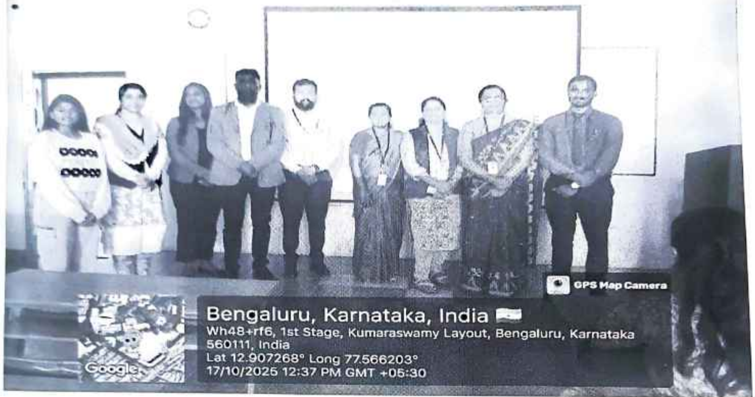
Pic 1. Faculty coordinators with guest speaker