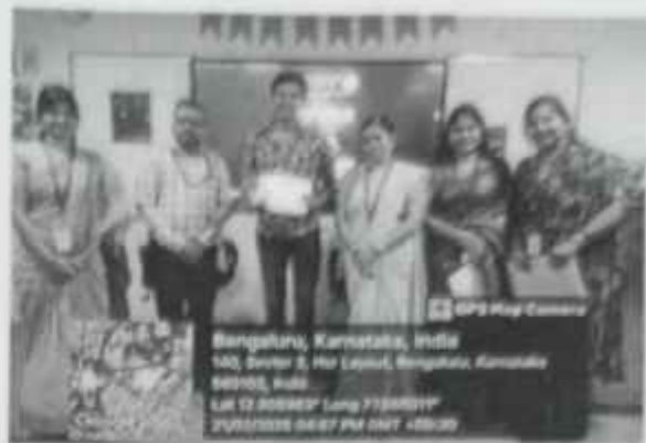
Congratulations to the 1st and 2nd prize winners