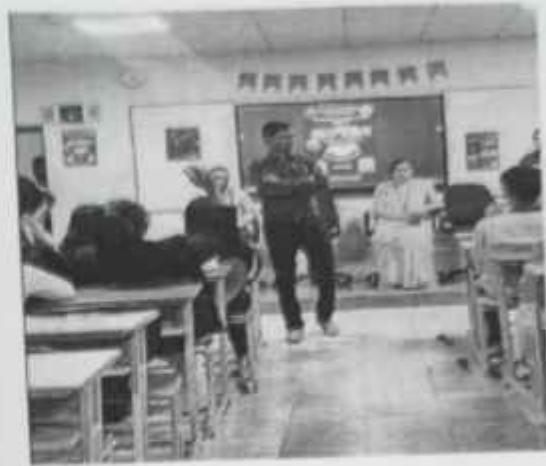
Commending the event with an insightful opening session