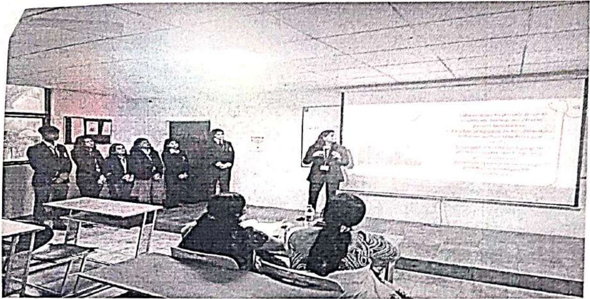
STUDENETS PRESENTING THEIR TOPIC.