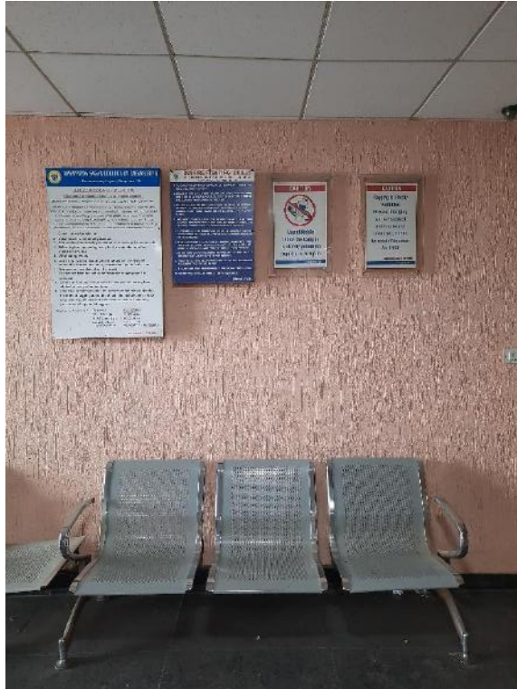
Photo 4.2 : Information about mobile phone ban inside college premises