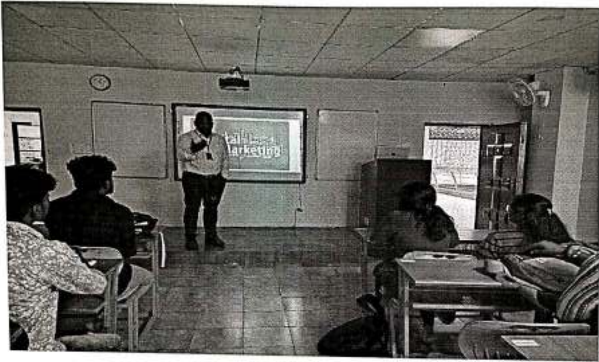
Figure 1 – During the session