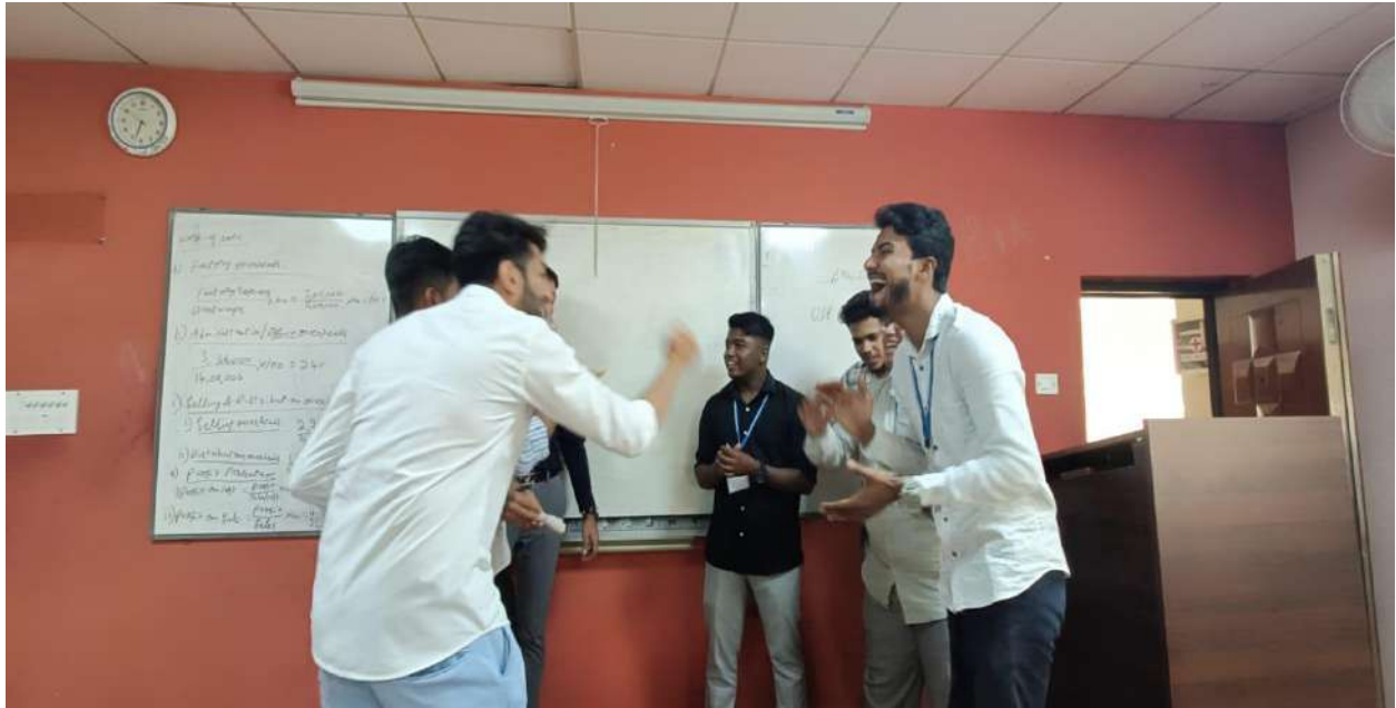
GROUP DEBATE FROM CLASS 4 TH SEM B.COM- D SECTION - TOPIC – COST