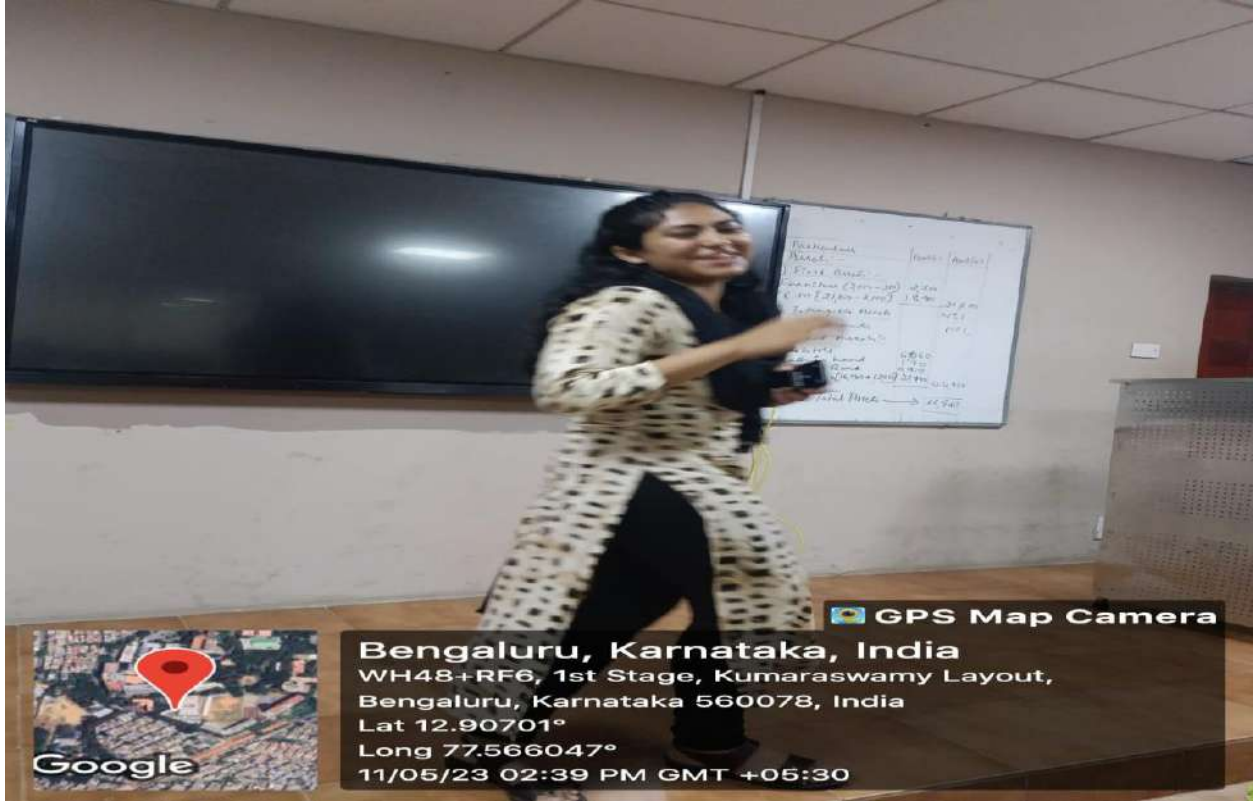
STUDENT FROM 2 ND SEM BBA-B SECTION