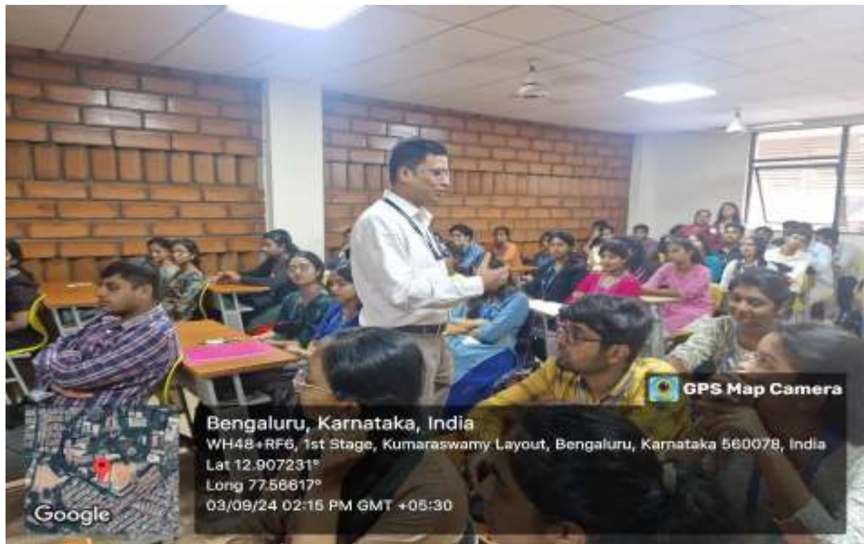
PRINCIPAL ADDRESSING THE STUDENTS ON THE OCCASION OF ESSAY WRITING COMPETITION