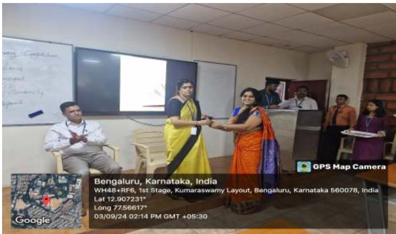
WELCOMING THE PRINCIPAL AND HODS OF THE DEPARTMENT