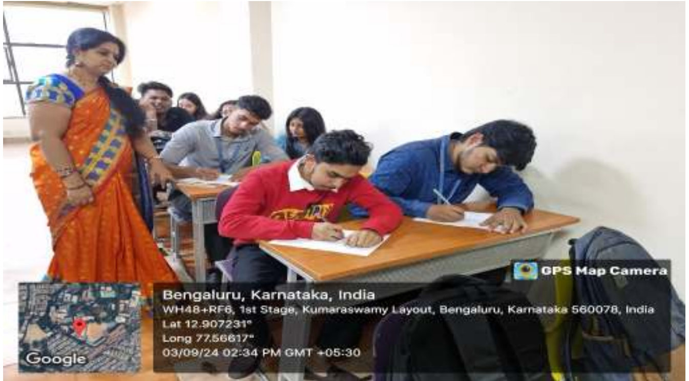
STUDENTS ARE WRITING ON GIVEN TOPICS FOR THE DAY OF COMPETITION