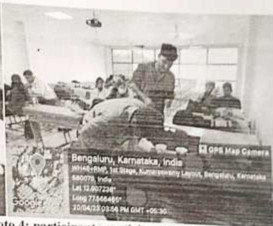
Photo 4: participants participating in the second round Enthusiastically