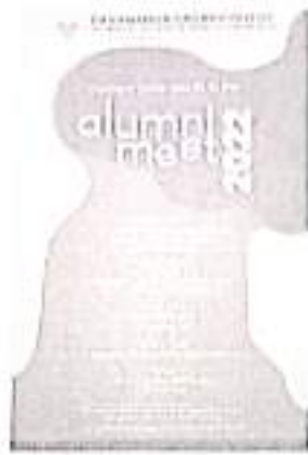
Photo 1 Alumni Meet 2022 Invitation