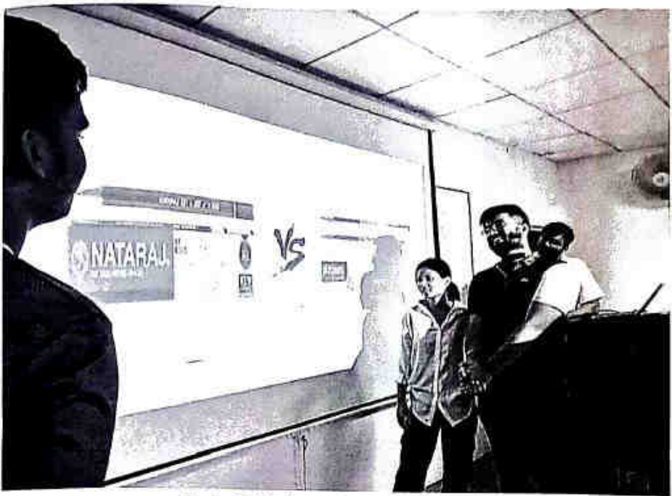
Pic. No. 02 Students Performing in What's Next

P I C N O. 03 J u d g e s c a l c u l a t i n g t h e R