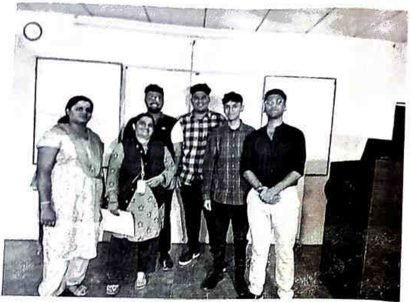
Pic. No. 04 Judges felcitating the winning Team of What's Next