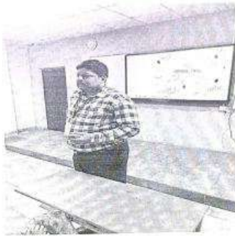
Pic 2: Speaker for the day