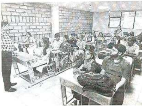
Pic 3: Clarifying Students qurey