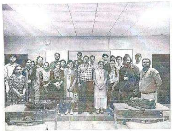
Pic 4: Event student coordinators, participants along with the chief guest and faculty coordinators