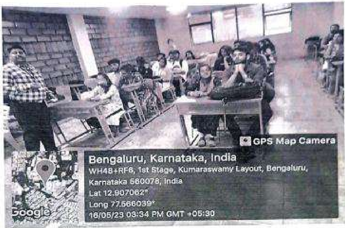
Pic 5: Geo tag photo