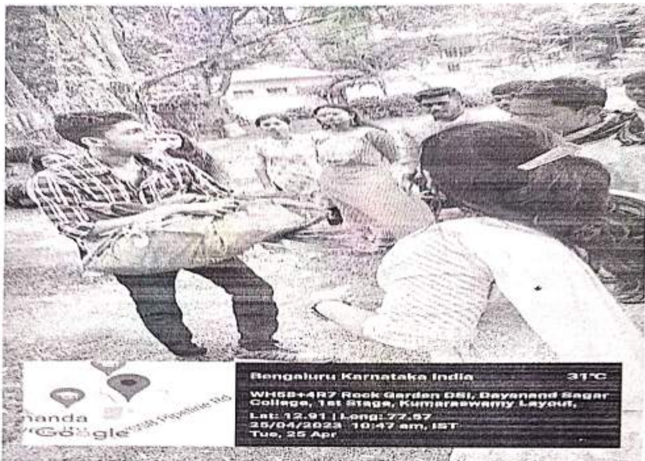
Pic 1 Faculty Cleaning the Campus