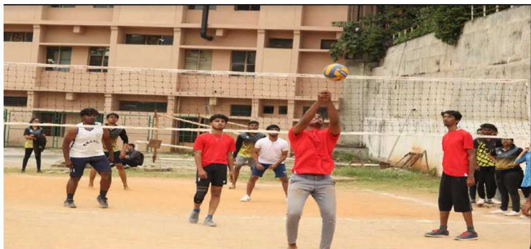
STUDENTS ARE TAKING PART IN VOLLEY BALL MATCH