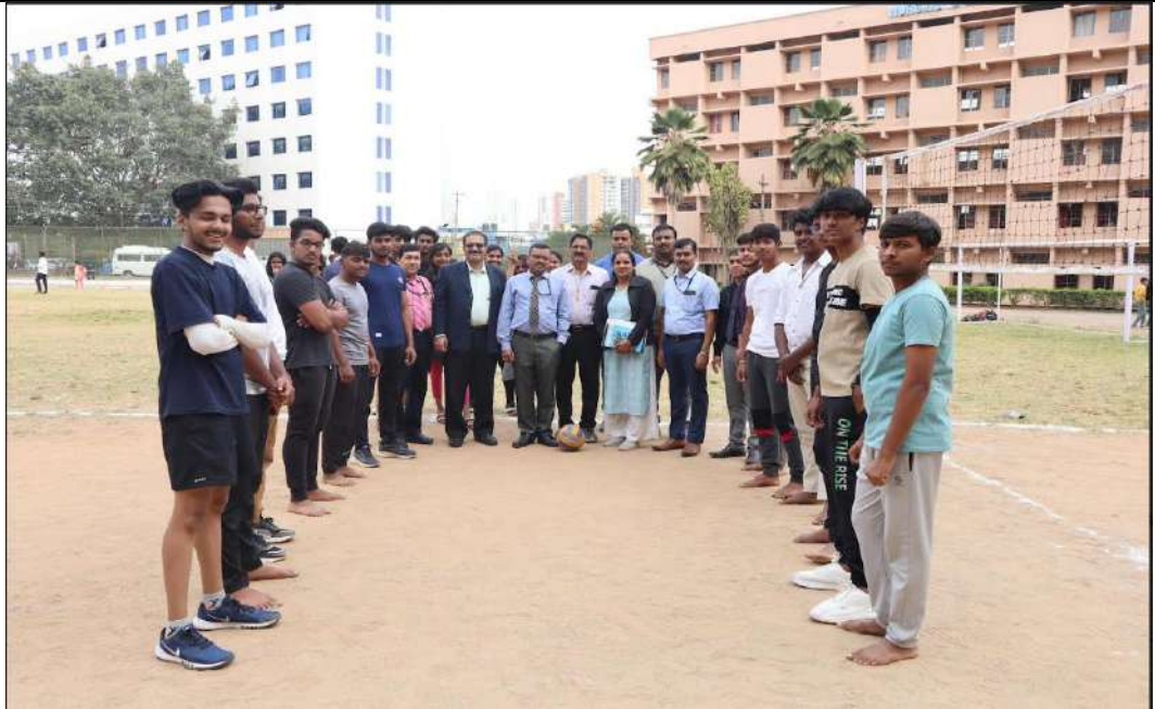
INAUGURATION OF VOLLEYBALL MATCH WITH PRINCIPAL, HOD'S & SPORTS CO-ORDINATORS