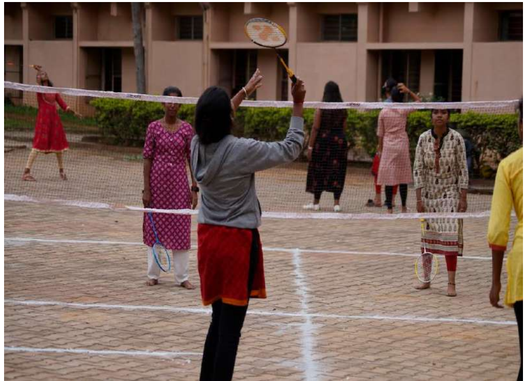
STUDENTS ARE TAKING PART IN SHUTTLE BADMINTON