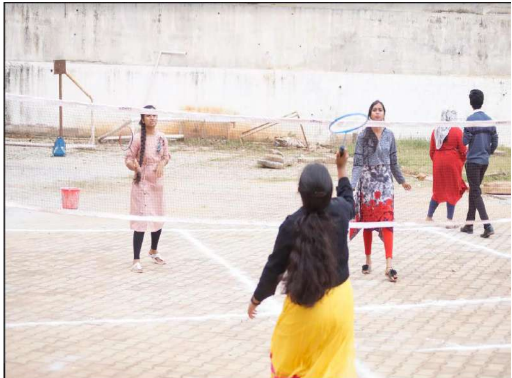
STUDENTS ARE TAKING PART IN SHUTTLE BADMINTON