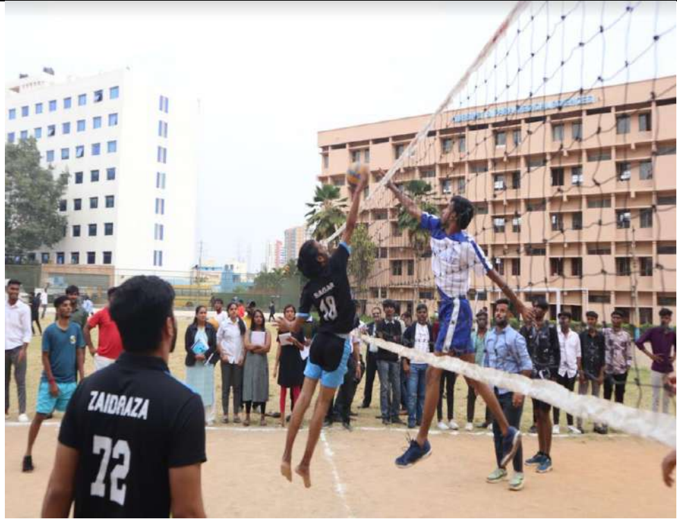
STUDENTS ARE TAKING PART IN VOLLEY BALL MATCH