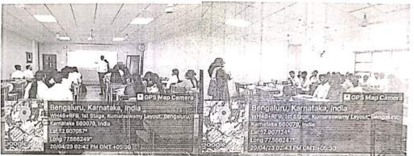
Students expressing their grievances