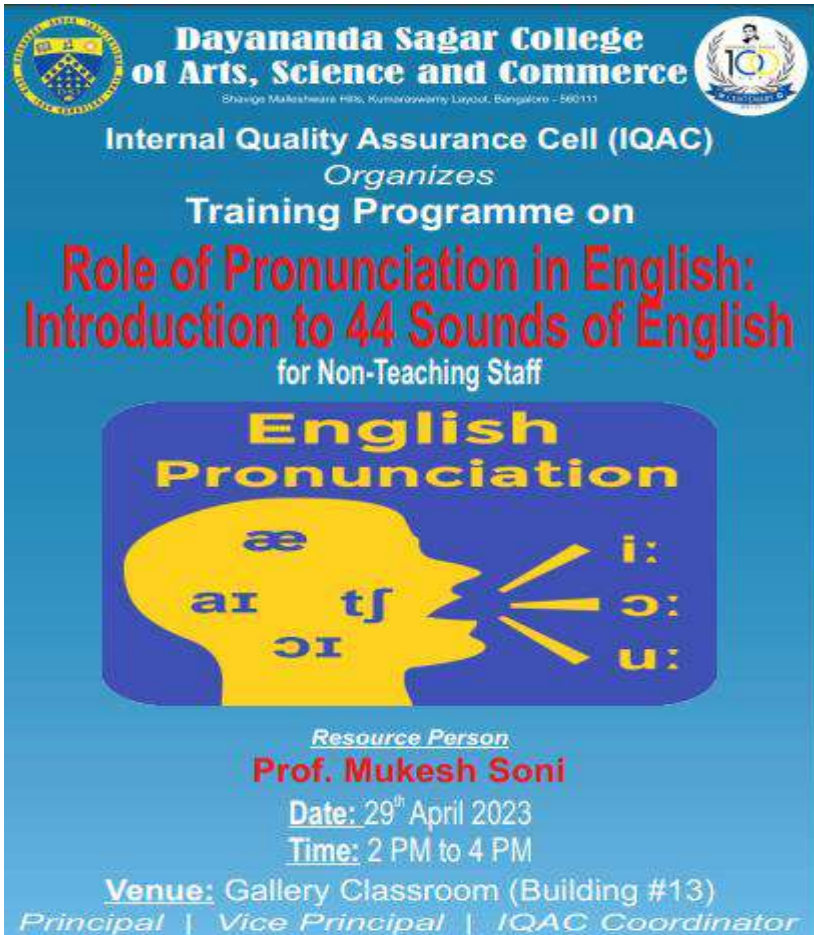
Poster of the Event