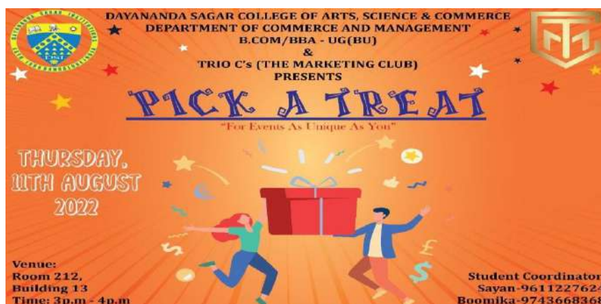
Picture 1. Poster Of The Event