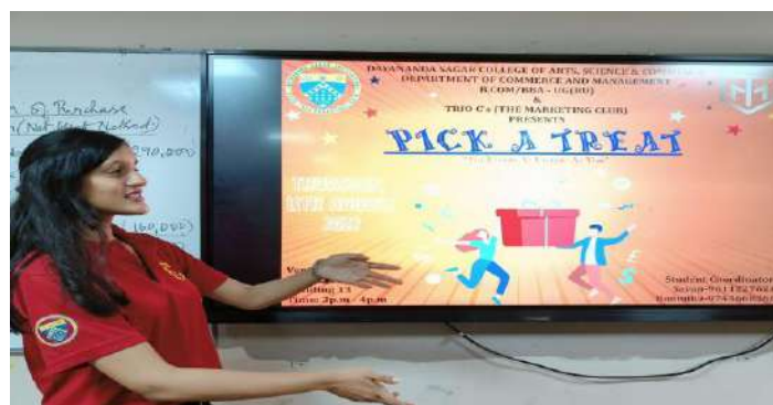
Picture 2. Welcoming the participants and Judge