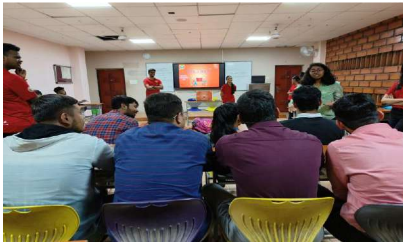
Picture 4. Audience