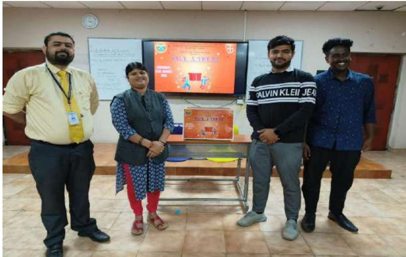
Picture 5. Winner And Runnerup