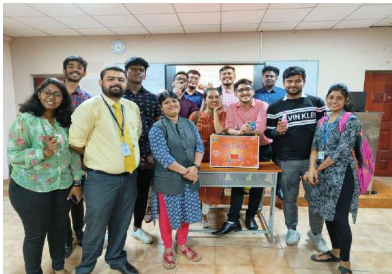
Picture 6. All Participants With Judge