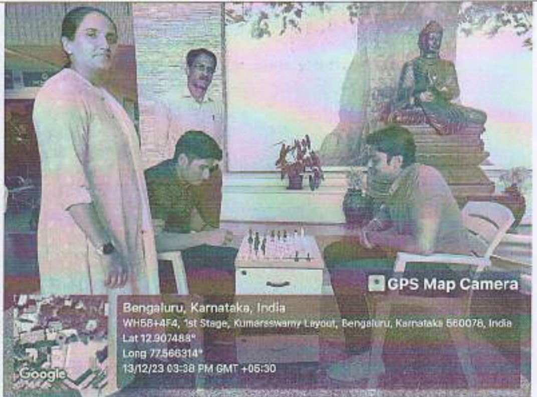
Students are taking part in chess event Boys