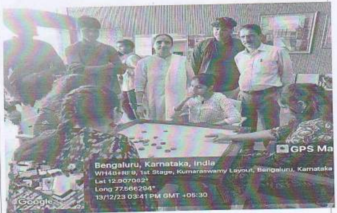
Students are taking part in Carrom event Boys

Bengaluru, Karnataka, India WH48+RF9, 1st Stage, Kumaraswamy Layout, Bengaluru, Karnataka Lat 12.907062° Long 77.566294° 13/12/23 03:41 PM GMT +05:30