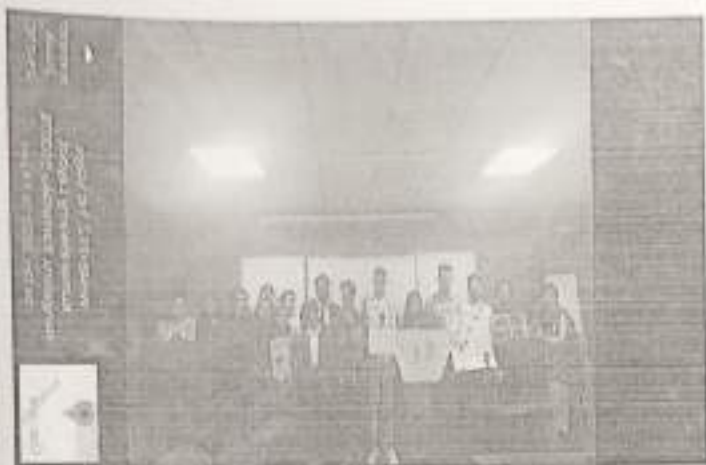
Posters made by students