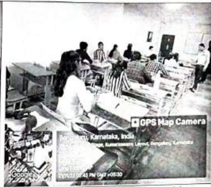
Photo 1.2 Students enthusiastically writing essay