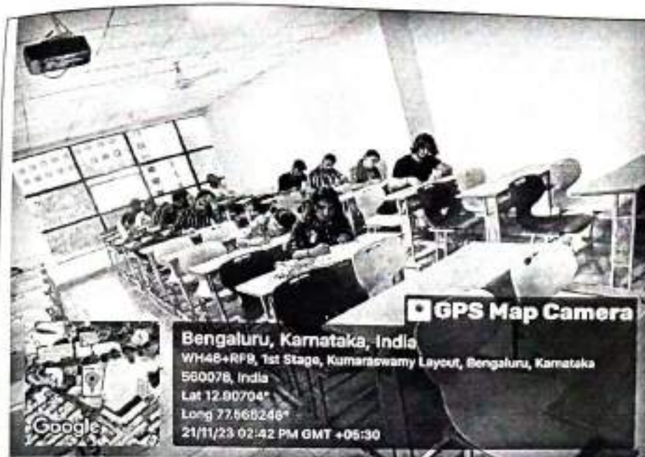
Photo 1.1 Participants of students in Essay Writing