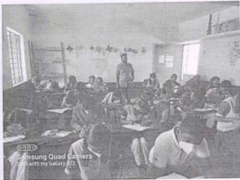
Pic 1 and 2: Volunteers monitoring Students during exam