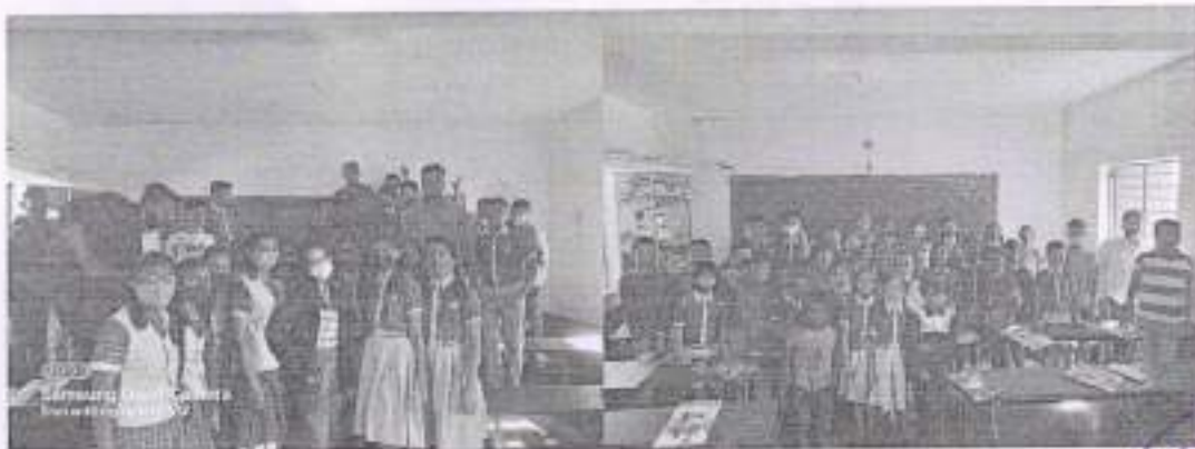
Pic 5 and 6: Group Photo with Volunteers