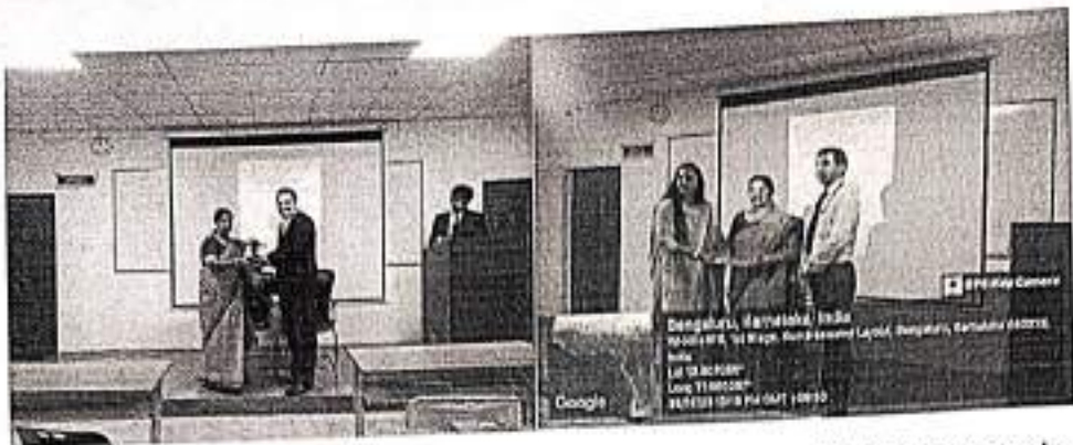
Welcome to speaker