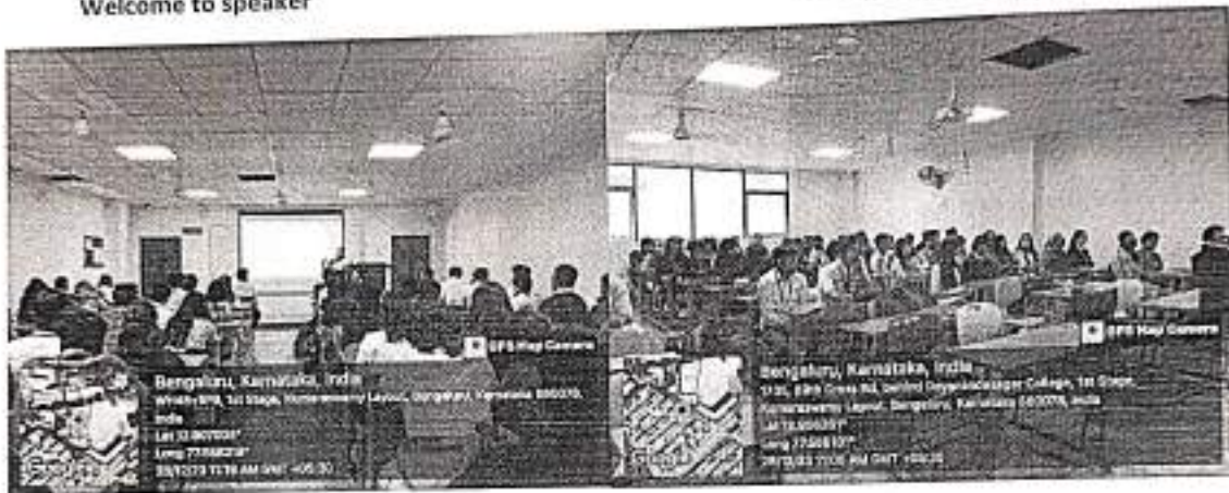
Speaker rendering the talk