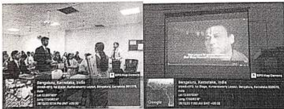
Interaction with participants